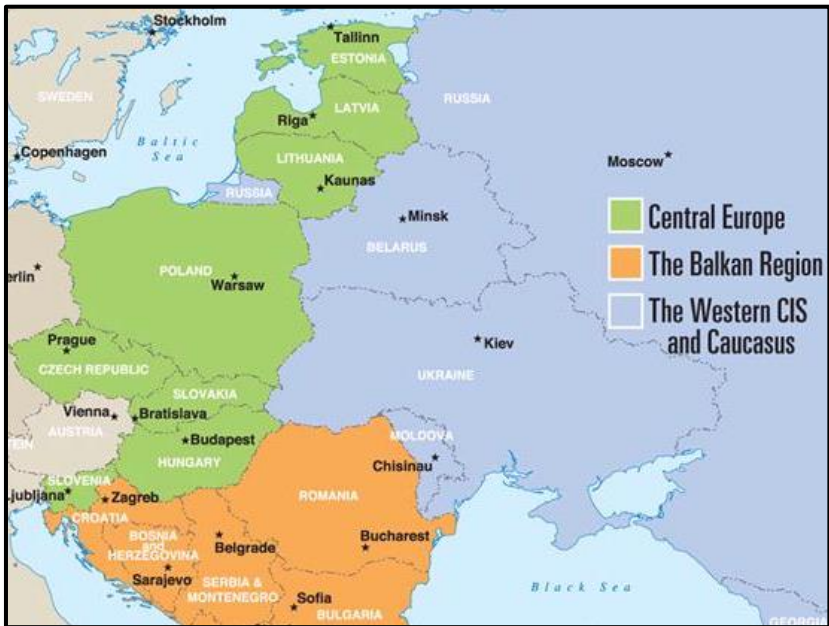
Fig. 1. Poland and the Baltic States.