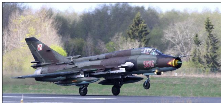
Fig. 3. Polish Su-22 in exercise “Spring Storm“ in Amari air base in Estonia (May 2013).