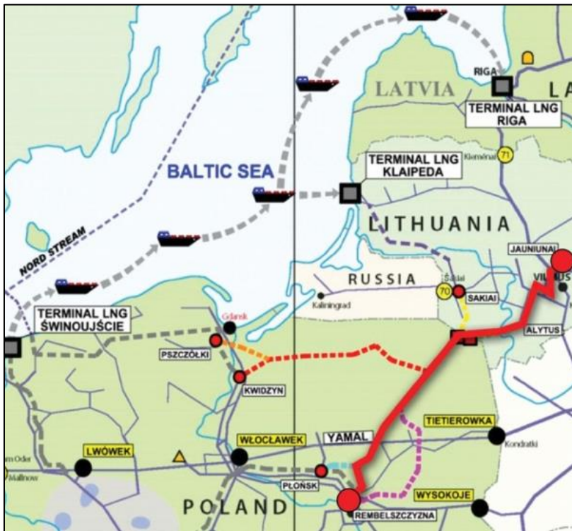
Fig. 2. Proposed location of the Gas Interconnection Poland – Lithuania (GIPL).