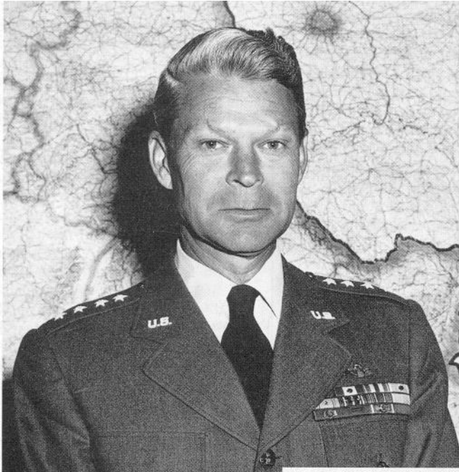
Norstad as SACEUR circa 1960