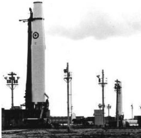
Thor Missile circa 1958

Whereas Norstad oversaw the creation of a NATO nuclear weapons stockpile under dual –key arrangements, his goal was to establish a truly European nuclear force whereby the US would supply NATO nations with nuclear technology and systems, and the Europeans would have the primary control of the weapons under guidelines set by SACEUR. The genesis of the Multilateral Force (MLF) concept, Norstad’s idea was picked up and backed by the State Department in 1960. The MLF negotiations that continued into the 1960s would eventually founder due to French President Charles de Gaulle’s insistence on French control of nuclear weapons on French soil, and the demand that the US assist France in developing her own independent nuclear force. Although willing to compromise on numerous nuclear issues, neither Norstad nor the US government could accept the French positions. It would lead eventually to France’s leaving the military side of NATO in 1966.