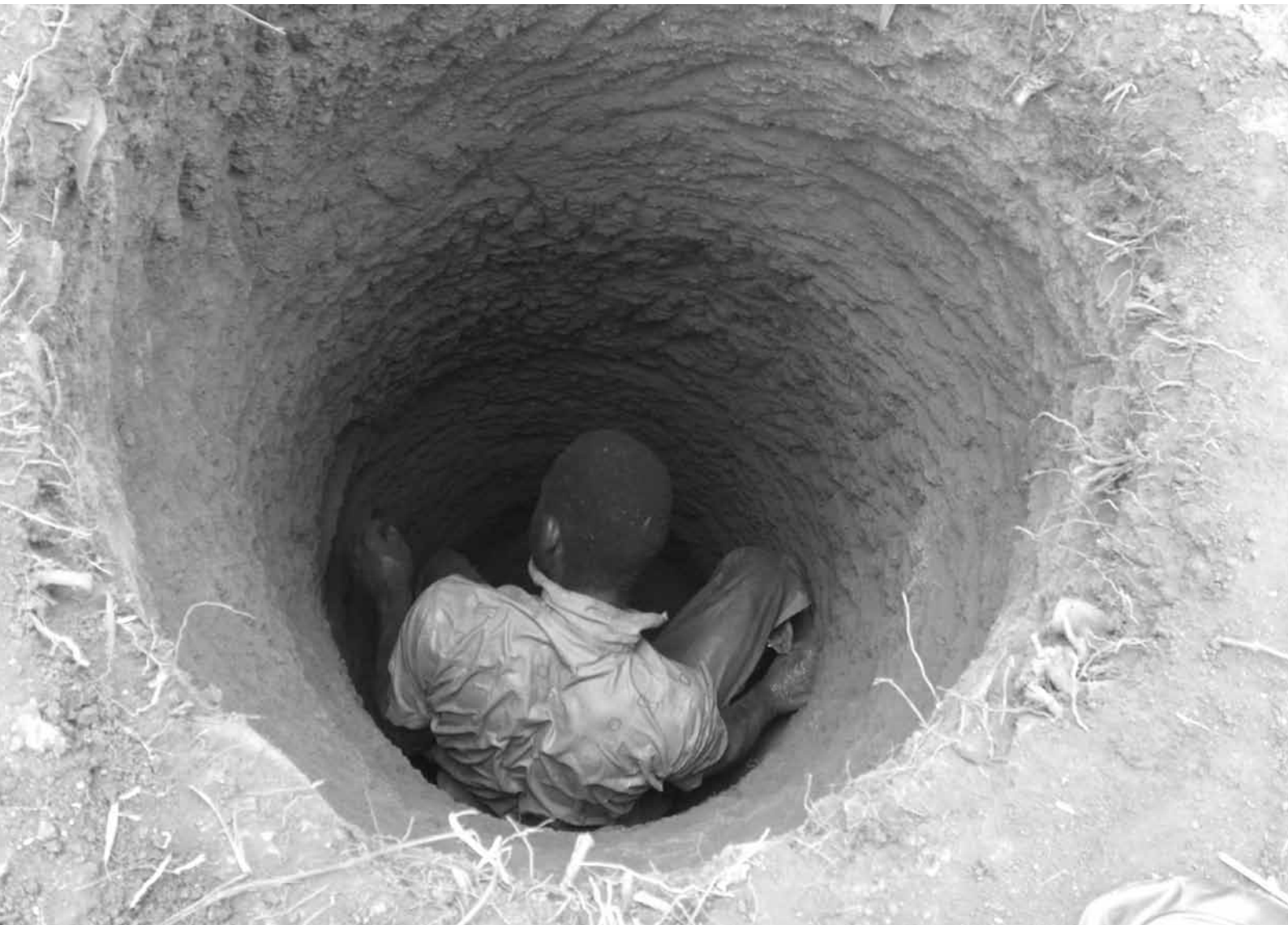
Gold digger in Côte d'Ivoire.