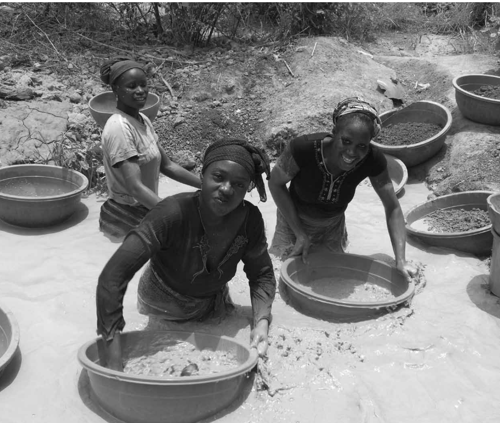
Women washing gold in Côte d'Ivoire.