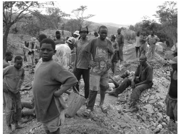
Artisanal mining in Rwanda.

time and the required skills of laboratory personnel. The second research project, developed in parallel, had BGR elaborating a chain of custody assurance systems, based on the establishment of transparent, traceable and ethical trading chains. This concept of Certified Trading Chains (CTC) found entry to the preparatory discussions for the G8 summit in Heiligendamm in 2007. The summit protocol stressed the need for action in the Artisanal and Small-Scale Mining (ASM) sector and acknowledged the potential of certification systems to increase "transparency and good governance in the extraction and processing of mineral raw materials (...) to reduce environmental impacts, support compliance with minimum social standards, and resolutely counter illegal resource extraction" (Article 85) 2 . It also expressed support for "a pilot study (...) concerning the feasibility of a designed certification system for selected raw materials" (Article 86) 3 . To this end, the German government has taken the initiative to design and finance such a pilot project for implementation in Rwanda.