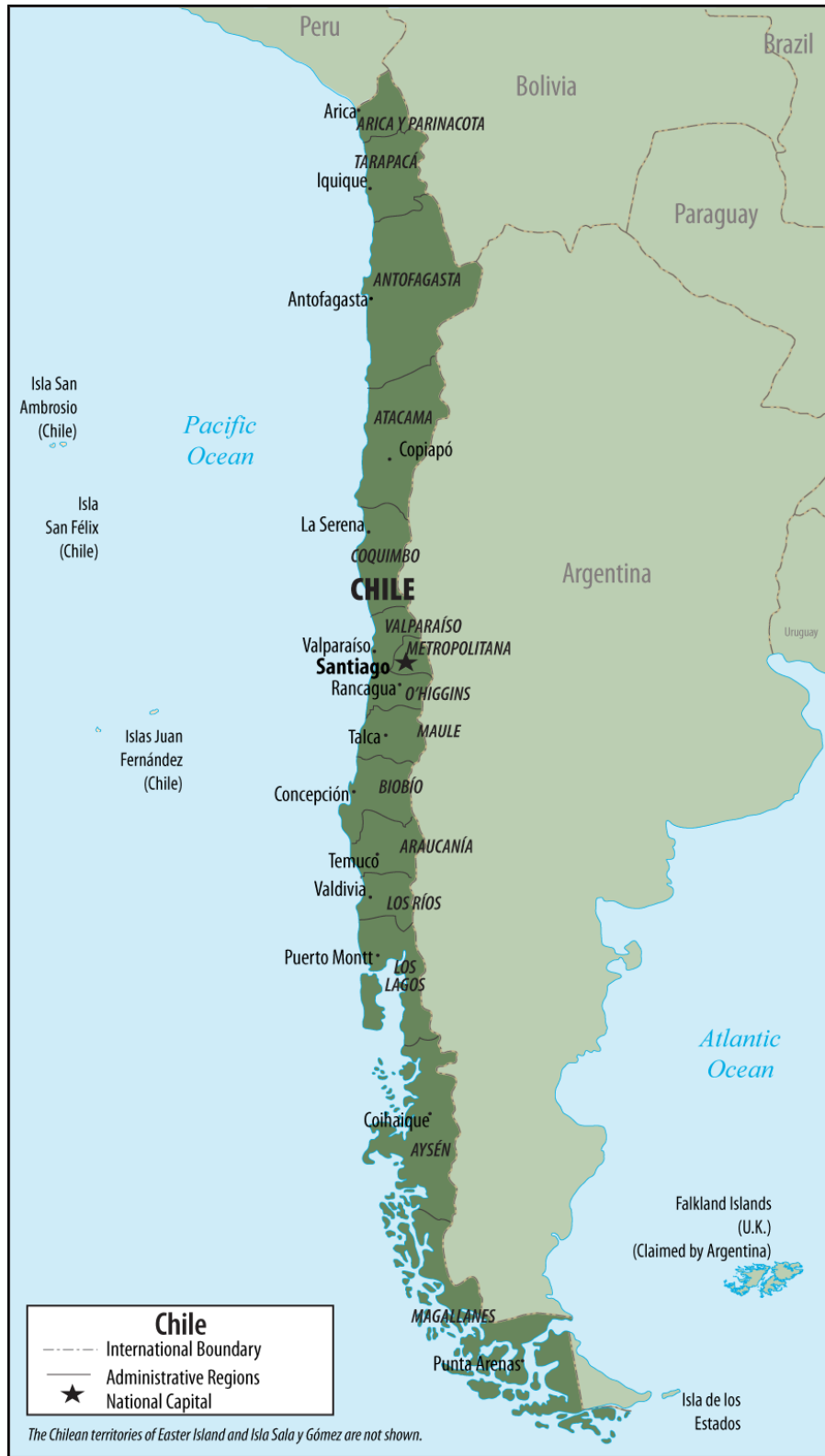
Figure 1. Map of Chile