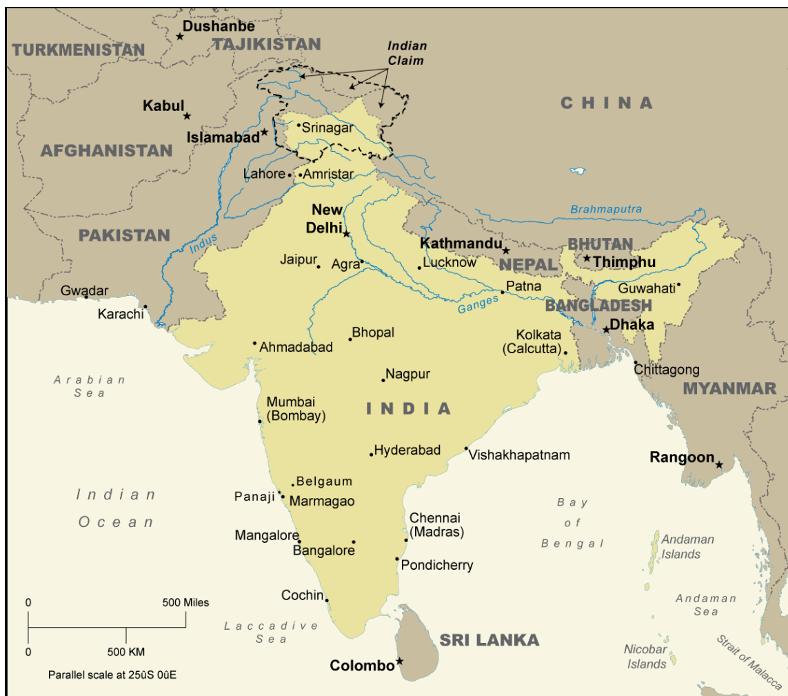
Figure 4. Map of India