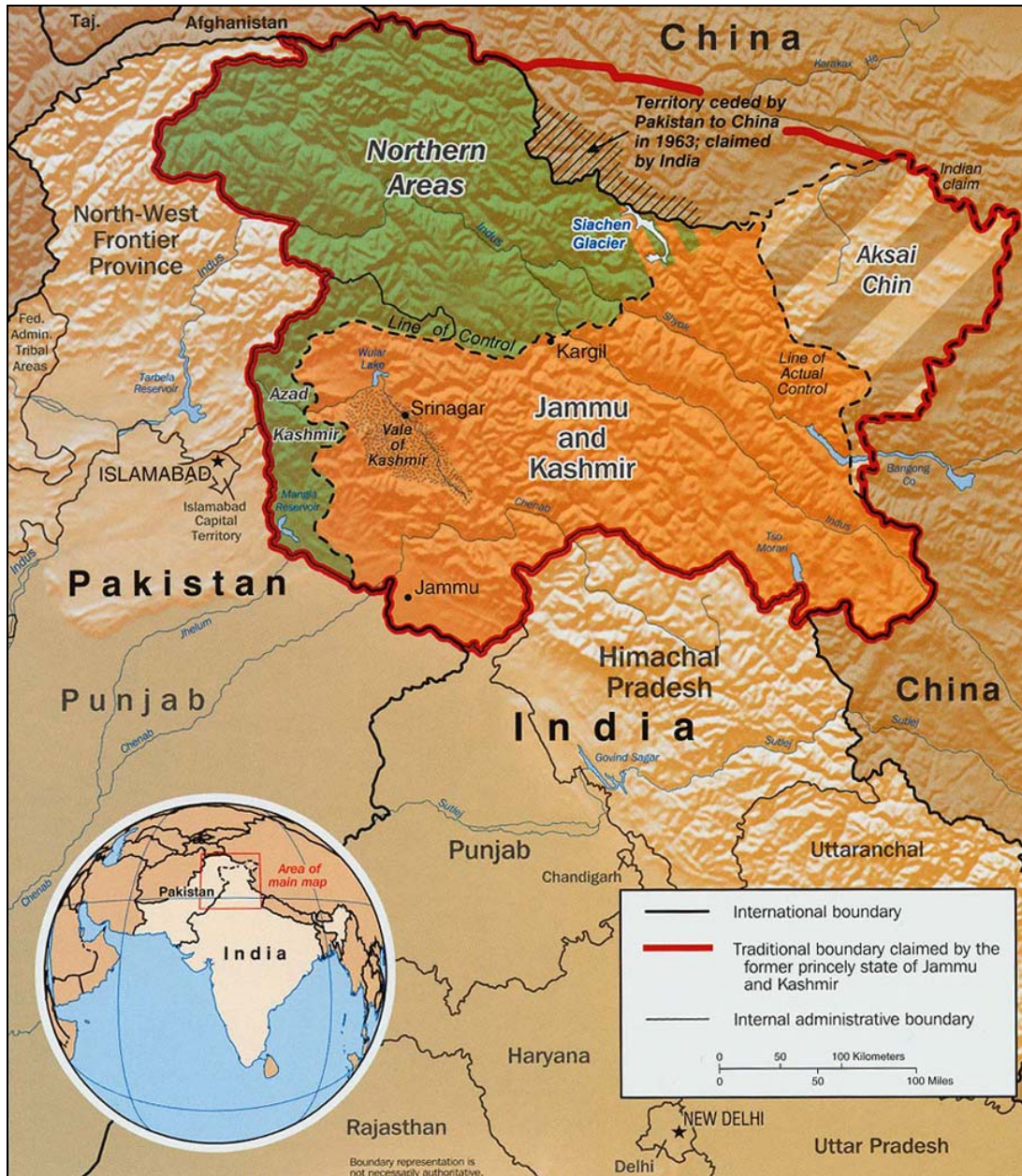
Figure 2. Map of Kashmir