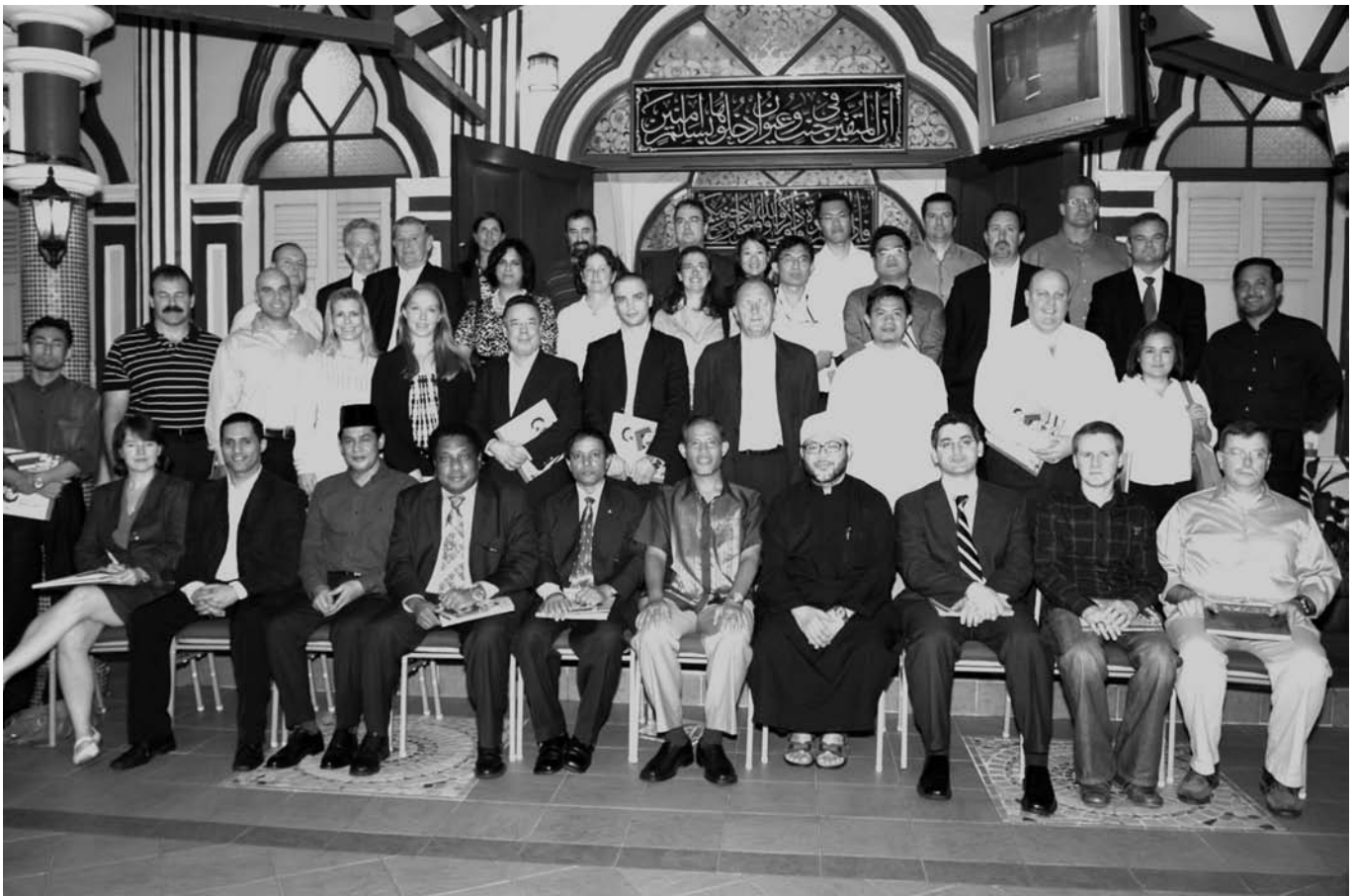
Guests and Participants of the International Conference on Terrorist Rehabilitation