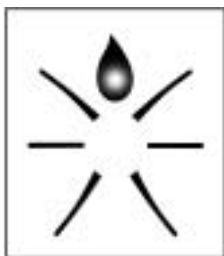
Human Rights Institute of Lyon (IDHL)