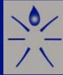
Human Rights Institute of Lyon (IDHL)