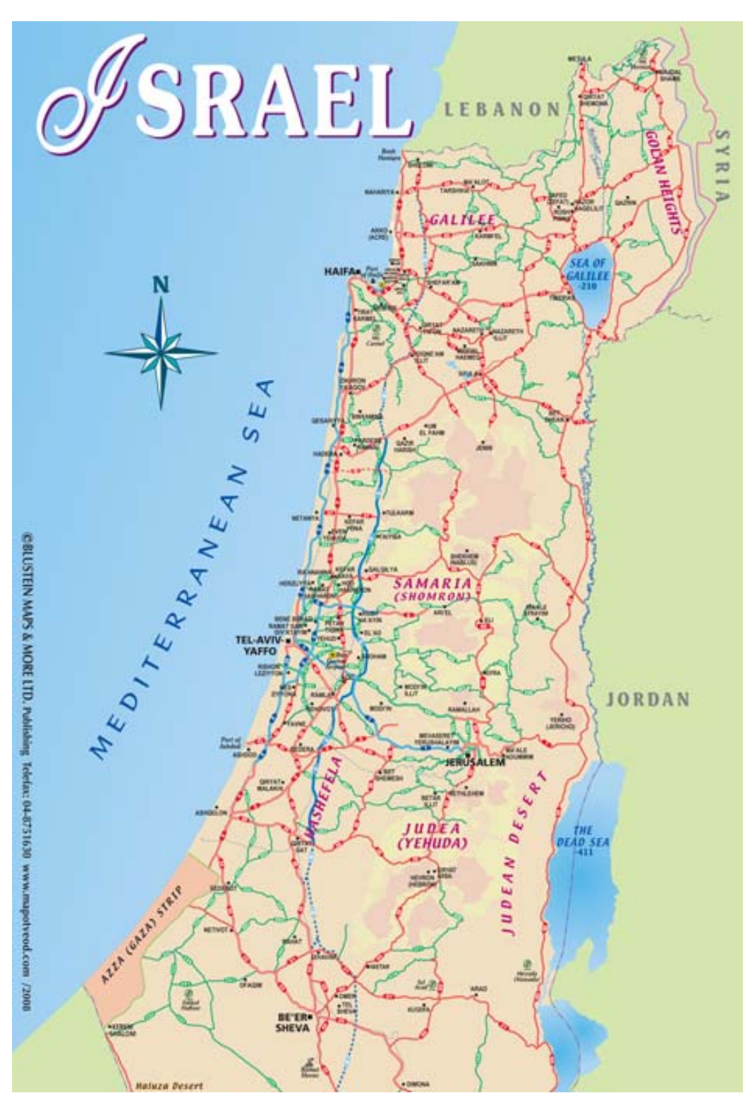
Map of Israel and the Occupied Territories without the Green Line, showing some settlements and West Bank towns. The shaded areas are Areas A and B of the West Bank, which the 1995 interim accords assigned to partial Palestinian Authority control. Map courtesy of Israeli Tourism Ministry website www.goisrael.com.