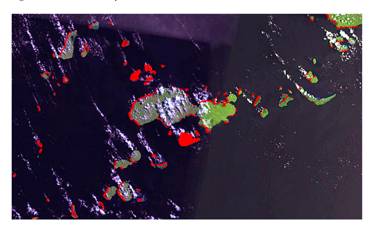
Figure 4 Sulu's vulnerability to sea-level rise

The dots on Figure 3 indicate areas particularly threatened by an encroaching sea. Of note is that the conflict-prone provinces of Mindanao have some of the highest risk indicators in the entire country. The conflict-prone islands of Sulu are the most threatened in all of the Philippines and both ecosystems and large population centres are vulnerable to sea level rise. Figure 4 shows this scenario, with the threatened areas shaded with red.