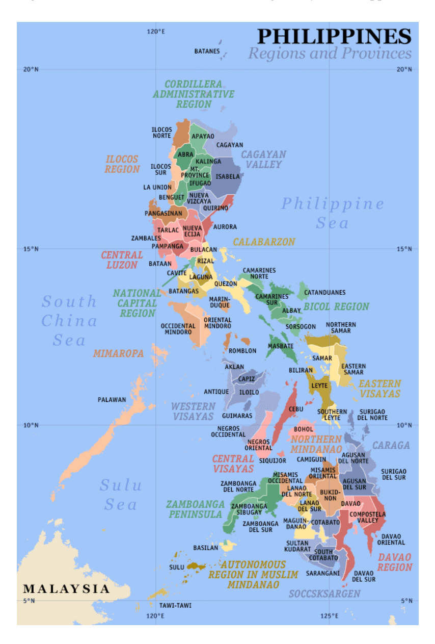
Figure 1 Provinces and Administrative Regions of the Philippines