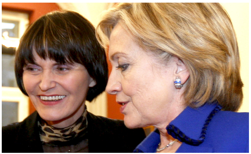
Peace support as a way of fostering relations: Micheline Calmy-Rey and Hillary Clinton at the signing of the Turkish-Armenian accord, 10 October 2009.

For several years, civilian peace support has constituted a key area of Swiss foreign and security policy. This has translated into concrete political achievements of late. These successes should not, however, distort perceptions as to what Switzerland's peace policy is capable of achieving in the field of conflict resolution and in terms of enhancing the country's political standing. Unrealistic and excessive expectations will invariably lead to disappointments and contribute to an erosion of domestic political support.