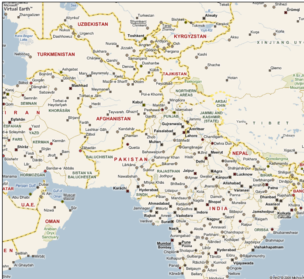
Map 1: Pakistan at the crossroads of Central Asia, South Asia and the Middle East