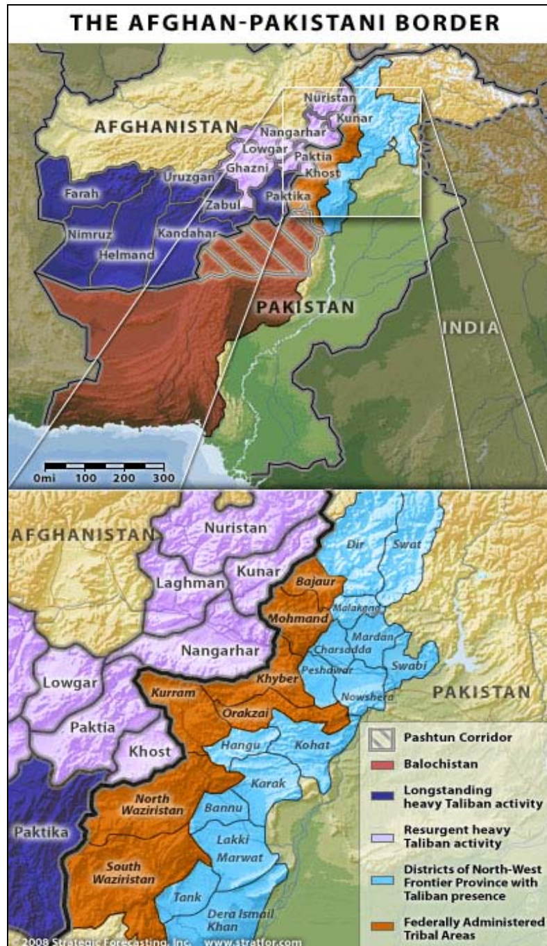
Map 5: Areas where the Taliban are more active (see box)