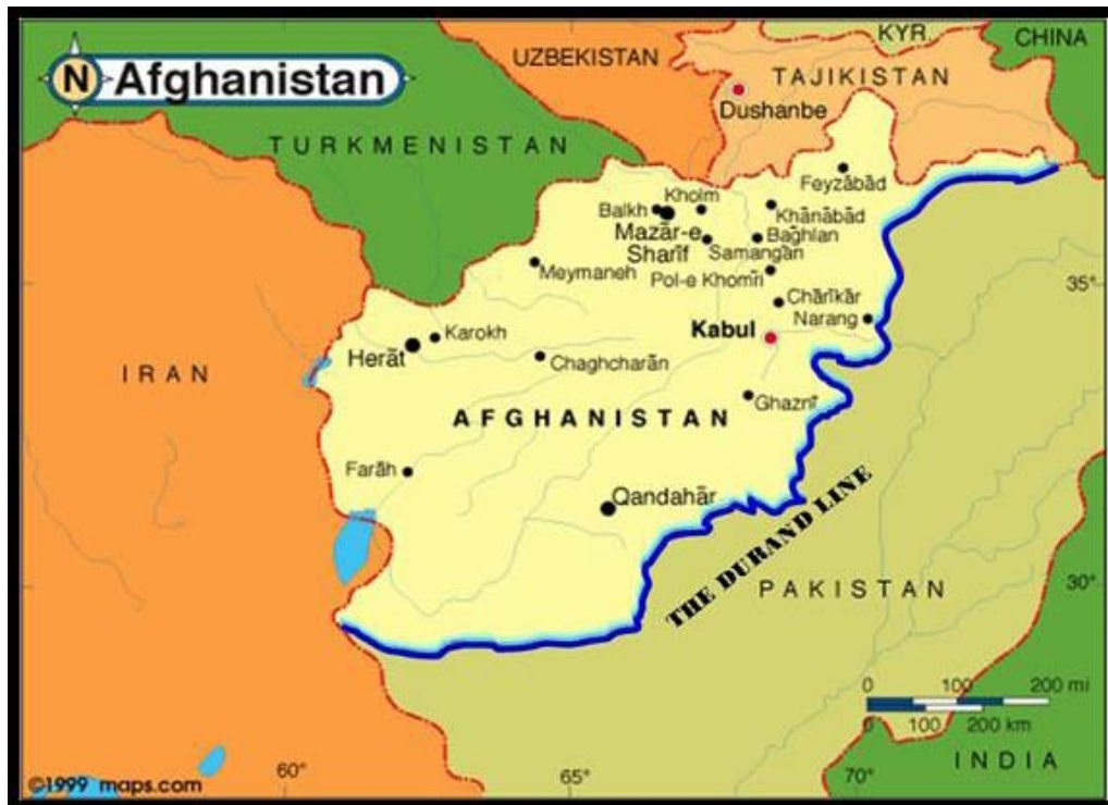
Map 2: The Durand Line demarcates the Pak-Afghan Border