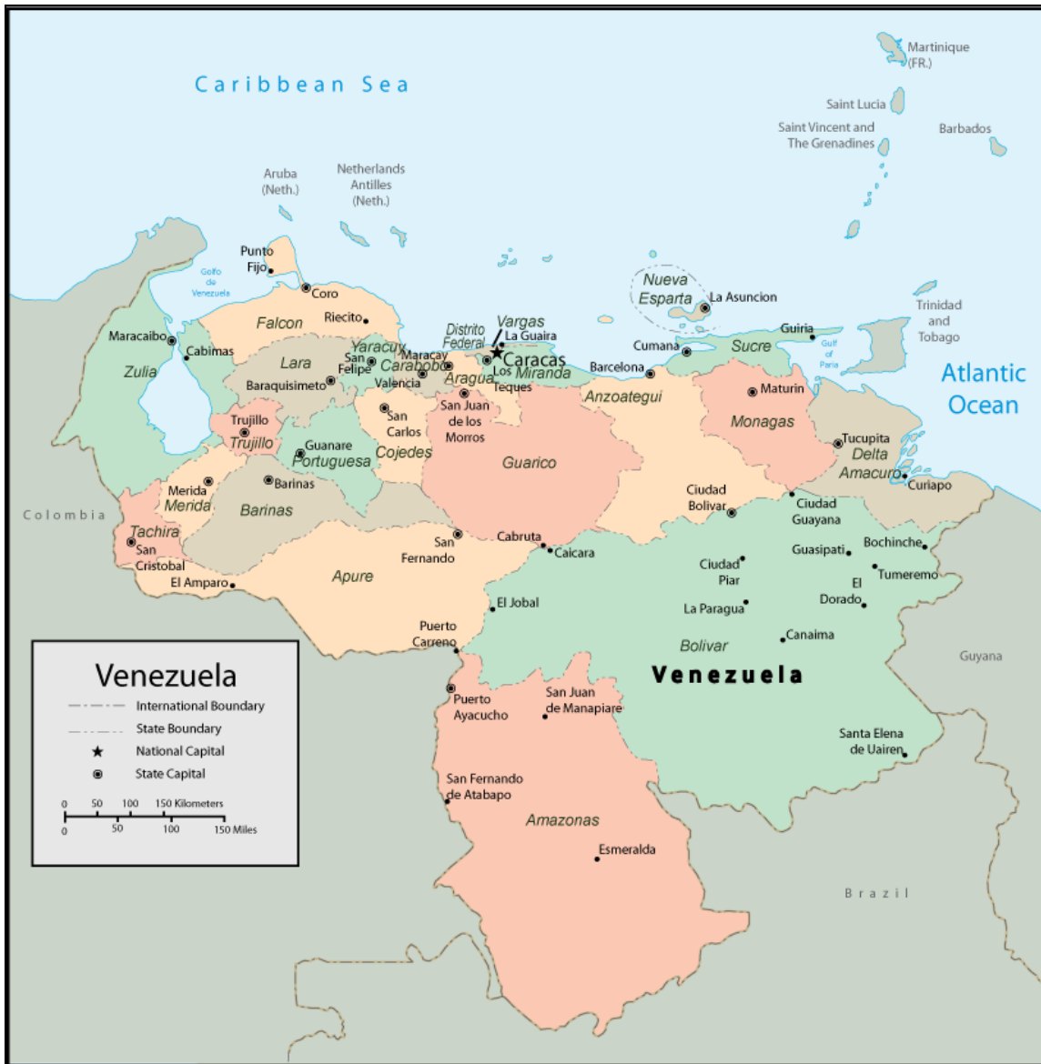
Figure I. Map of Venezuela