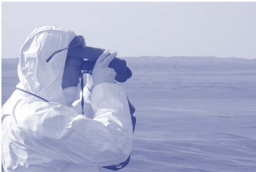
Inspector on watch, CTBTO on-site inspection exercise, Kazakhstan, 2008

Ongoing and collegiate activity by NDCs to analyse ambiguous events would help to establish as normal the objective of clarifying the nature of events, and lead naturally to the use, where appropriate, of the clarification mechanisms that are explicit in the Treaty.