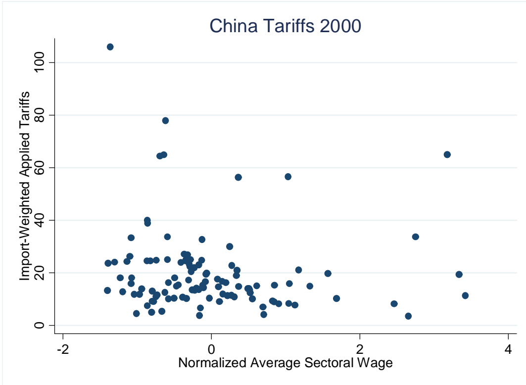
Figure 2: Import-Weighted Applied Tariffs and Average Wages in Chinese Manufacturing in 2000. This figure plots import-weighted applied tariffs in 4-digit, ISIC, Revision 3 manufacturing industries in China in 2000 against normalized average wages in these industries. See text for sources.