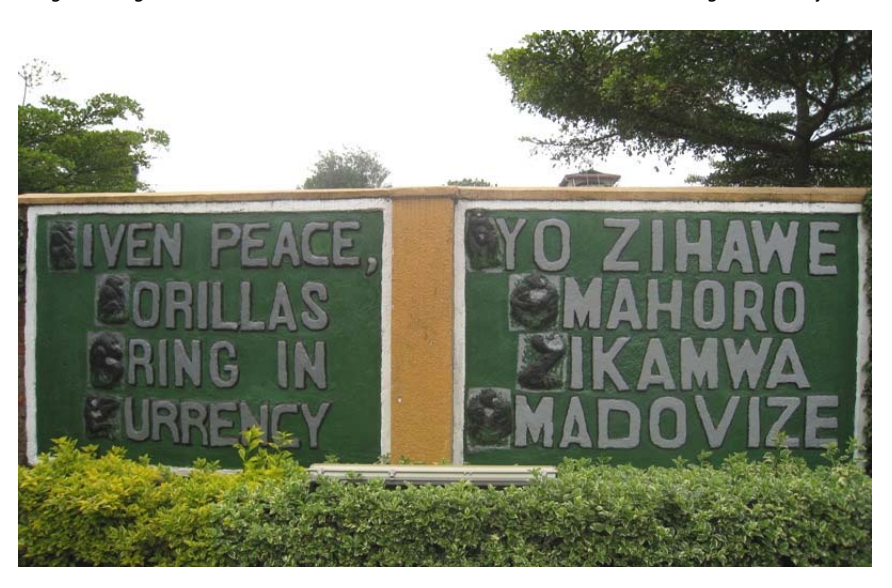
Image 4.1: Sign outside Muhabura Hotel, Musanze: Given Peace, Gorillas Bring in Currency.