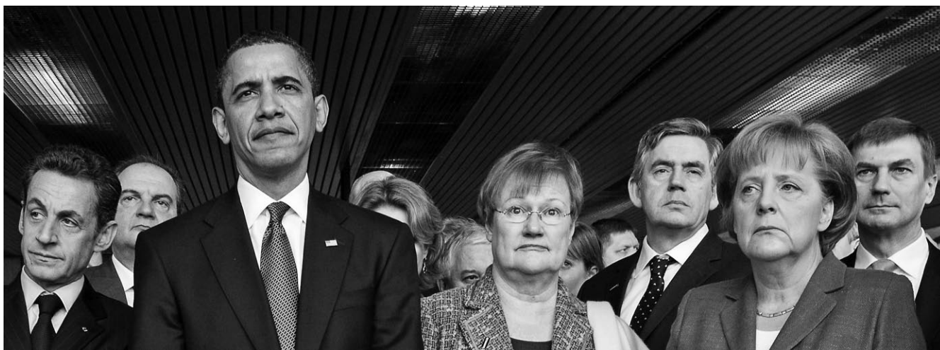
The US pull-out from the EU's May summit showed that the EU is yet to tackle its enduring problem of multiple representation in foreign affairs.

service and the instincts of its constituent parts, the member states, to ensure that their diverging national interests were served. Publicly, the Council rallied to the defence of Catherine Ashton at the Cordoba summit in March 2010 by backing her preliminary proposals and calling for the creation of an effective and functional diplomatic service. EU foreign ministers also defended the HR/VP's sole authority concerning appointments and control of the EU's upgraded delegations around the world. They would like to see a "horizontal" division of labour between the EEAS and the Commission in areas such as development policy, which would leave much of the responsibility for strategic decision-making with the EEAS. These pronouncements were interpreted by many in the EP to mean that the Council intended to take charge of foreign policy areas previously falling under Community competence. Additionally, there were divisions between member states, especially concerning the staffing of the EEAS.