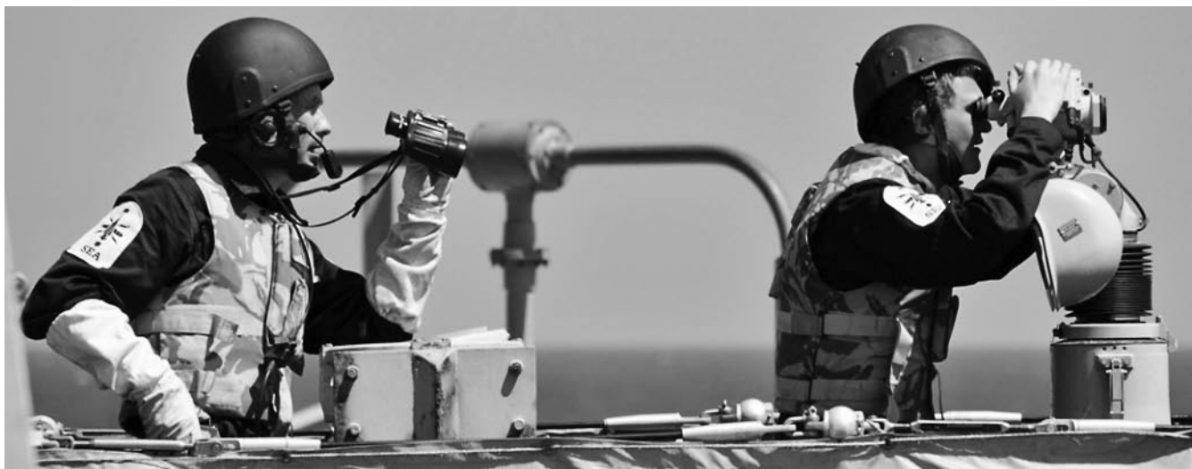
The EEAS is likely to act as a force multiplier for EU operations.

With the Lisbon Treaty finally ratified, EU attention has now shifted towards the arduous task of implementing the treaty reforms. Central amongst these is a complete overhaul of the existing structures of EU foreign policy-making, providing the EU with a new “double-hatted” foreign policy chief—in the person of Catherine Ashton—and creating the European External Action Service (EEAS). Conceived as the EU’s own diplomatic corps, the EEAS has been lauded as a “once in a generation opportunity” that will endow Europe with a greater voice and more influence in international affairs.