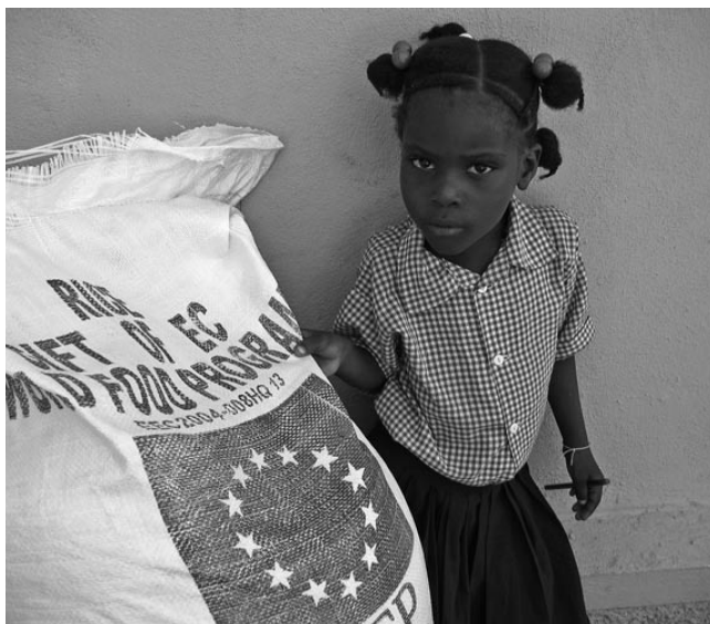
The EEAS is set to increase coherence in EU foreign aid.

new Foreign Minister was to be assisted by the EEAS, which would be composed of staff from the relevant directorates of the Council and the Commission, as well as the national diplomatic services. The ambitious goal for the new service was that it would develop into a fully-fledged Ministry of Foreign Affairs that would assist the EU Foreign Minister in carrying out the entire spectrum of her tasks.