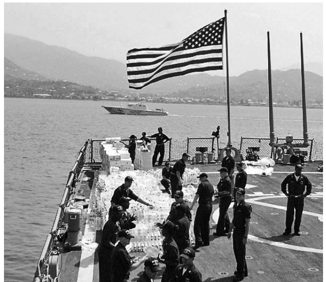
US aid in action. With the Lisbon reforms the EU aims to attain more global visibility.

Most importantly, the guidelines determined that the EEAS would be established as a sui generis institution to be staffed with personnel from the Commission, the Council and the member states. It was further determined that the new institution should be composed of single geographical and thematic desks that would allow it to play a leading role in strategic decision-making and involve it in the whole programming chain of the EU's external policies, while leaving the specific division of labour with the Commission to be determined at a later stage.