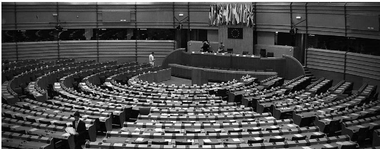
Gearing up for a fight: The European Parliament demands a greater say over EU foreign policy.

The EP, despite thus far having failed to get its way, maintains roundabout channels of influence on the EEAS, including the politicisation of issues and the unwieldy power of dismissing the Commission. As the Parliament also retains legislative authority over staffing regulations and the budget of the EEAS, it cannot be wholly ignored. Instead, it will be consulted on a regular basis and is expected to make its powers felt in other ways. The delaying of its vote on the financial and staffing regulations until after the Council has made its decision establishing the EEAS a prime example of the EP exerting pressure on the other actors, goading them to anticipate its wishes without yet quite torpedoing their decisions. The Parliament, due to institutional self-interest and a genuine fear of a “de-communitarisation” of EU foreign policy, is set to fight for its views.