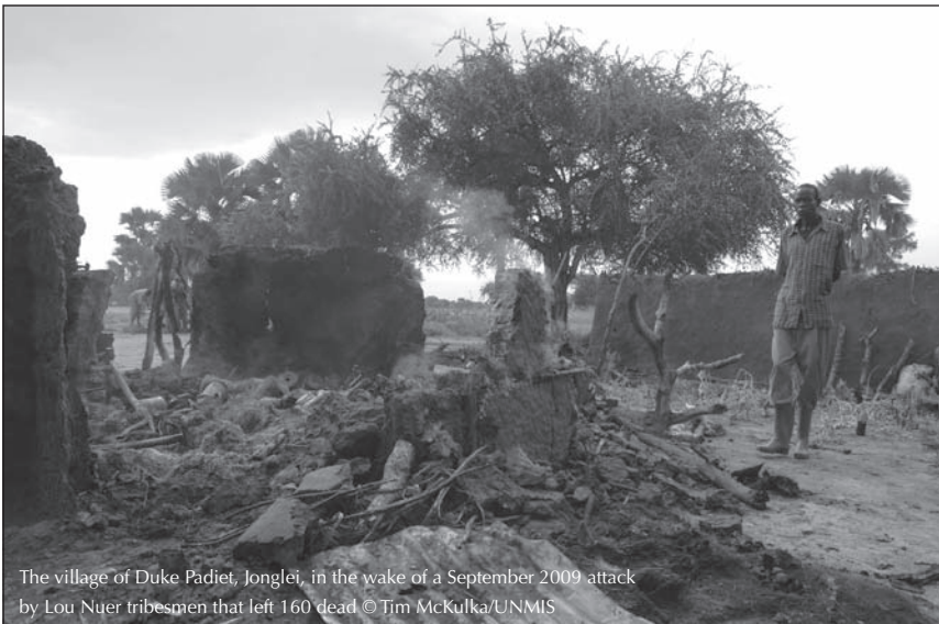
The village of Duke Padiet, Jonglei, in the wake of a September 2009 attack by Lou Nuer tribesmen that left 160 dead

Striking features of the wave of violence in 2009 were the increased frequency of the attacks, the deliberate targeting of villages (as opposed to cattle camps for raiding purposes), and the fact that women and children made up the majority of the targeted victims (MSF, 2009, pp. 14–15; see Table 1). A typical attack of this kind—on Kalthok village in Lakes State in November 2009—saw 41 people killed, 10,000 displaced, and about 80 per