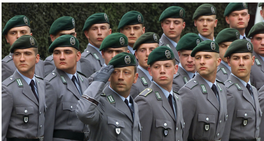
Recruits of the German army sworn in in Berlin. 20 July 2000

The decline of conscription is a key element in the transformation of European armed forces since the end of the Cold War. The majority of EU member states have introduced professional all-volunteer forces (AVFs). The reasons for this trend are both military and societal. Given today's geostrategic environment and the resulting task spectrum of European armed forces, the shift to AVFs is a logical development. The transition, however, requires a range of thought-out measures to secure appropriate recruitment levels and make the armed forces competitive on the labour market.