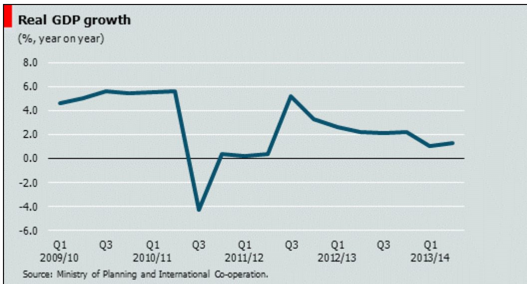
Figure 3. Egypt's Real GDP Growth

Egypt's economy is barely growing; economists project perhaps 2% growth for the current Egyptian fiscal year, an amount that just exceeds the country's annual population growth rate. 34 For Egypt, the good news is that the economy is no longer contracting, as some foreign direct investment has returned, and foreign currency reserves are no longer dwindling, stabilizing at $17.4 billion as of April 2014. They had been at $36 billion before unrest began in 2011.