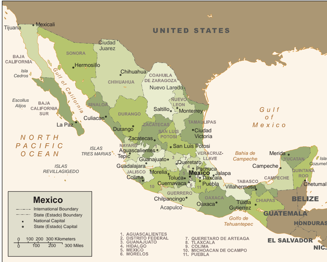
Figure 1. Map of Mexico