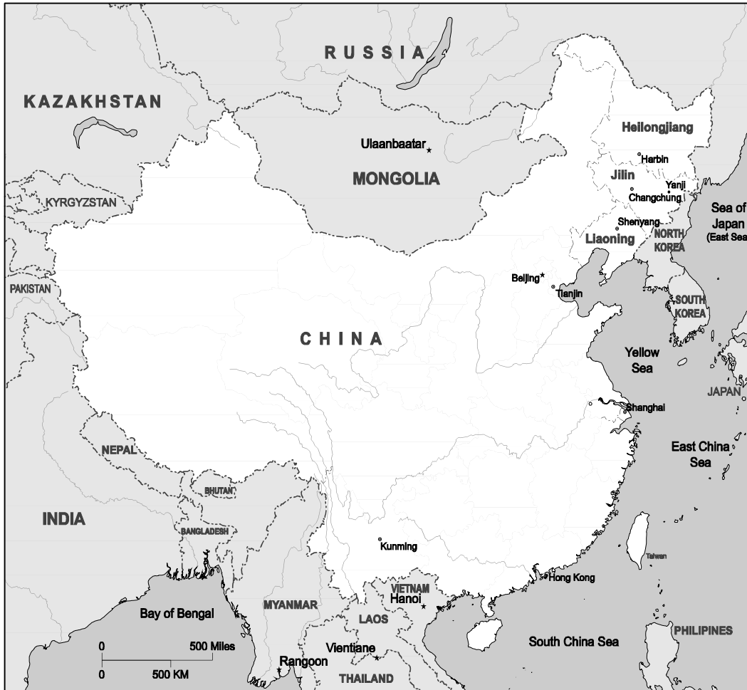
Figure 1. Regional Perspective on North Korea and China