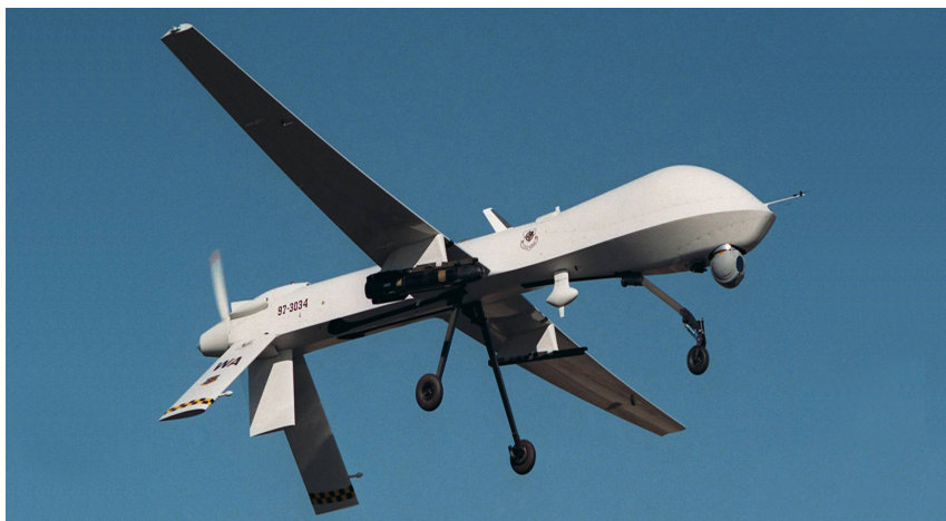
MQ-1 Predator drone armed with Hellfire missile

Drones have assumed a leading role in counterterrorism and counterinsurgency, and are projected to be of growing importance in future military operations. Their low cost makes them expendable and ideal for highly dangerous or politically sensitive missions. However, technical limitations as well as likely improvements in competing technologies, notably air defence systems, shall circumscribe the military role of drones. Although an integral part of future warfare, they are unlikely to fully replace manned aircraft and will instead, complement them.