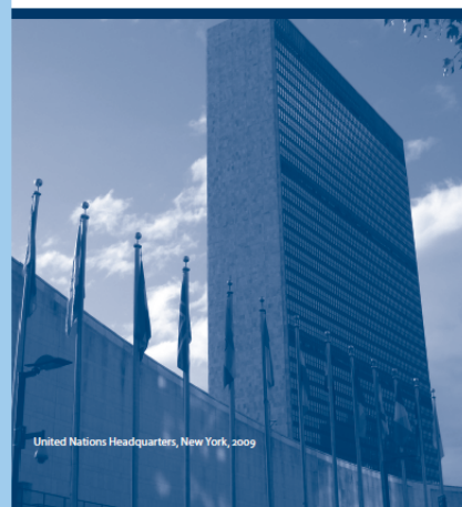
United Nations Headquarters, New York, 2009