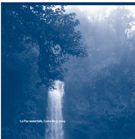
La Paz waterfalls, Costa Rica, 2009

VERTIC holds observer status at the IAEA General Conference and has consultative (roster) status with the UN's Economic and Social Council.