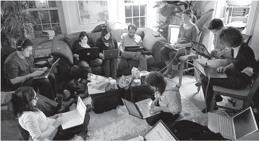
The Fletcher Crisis Mappers at work in Boston.

media sources to identify actionable pieces of information that could be of use for responders on the ground. If a piece of information was deemed useful and had a location attached to it, volunteers would find the GPS coordinates through Google Earth and OpenStreetMap and map it on haiti.usahidi.com for anyone to view and utilize. Through the aggregation of individual reports, the crisis mappers were able to identify clusters of incidents and urgent needs, helping responders target their response efforts.