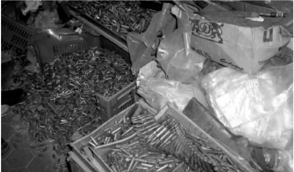
Poor ammunition storage

Explosions within an ammunition storage area can cause devastating damage and casualties in neighbouring communities. In addition to the direct human, social and economic costs of the explosion, the economic costs of the subsequent explosive ordnance disposal (EOD) clearance process can be very substantial.