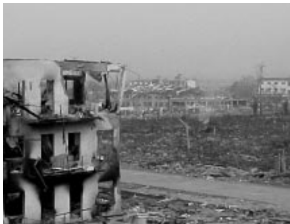
Effects of ammunition storage area explosion, Lagos, Nigeria, 27 January 2002

Risks can only be kept at tolerable levels if the ammunition management systems and storage infrastructure are to appropriate standards or in accordance with 'best practices'. A recent desk study by the Geneva International Centre for Humanitarian Demining (GICHD), 21 supplemented by some further research at SEESAC, has identified a significant number of recent explosive events that have occurred due to inappropriate storage or explosive safety procedures. Table 1 lists some recent explosive events at ammunition storage areas. The research data was obtained from Internet searches and a very limited response to a formal request for information. 22 It is no doubt incomplete: there are probably very many more incidents that have yet to be identified. Moreover, appearance on this list should not allocate or imply blame for the explosive event. Due to the patchiness of public information, appearance on this list may be testimony to the transparency and willingness of the State authorities involved to identify and learn lessons: many authorities take a less responsible approach.