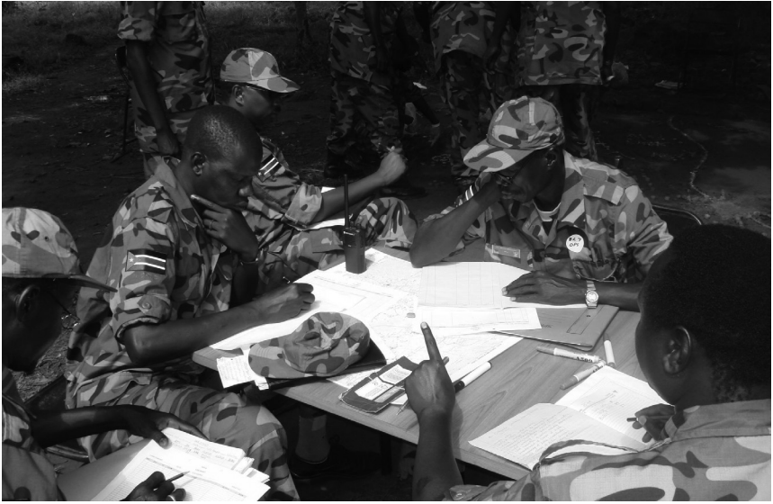
SPLA officers during training at Malou Command and Staff College, 2008.