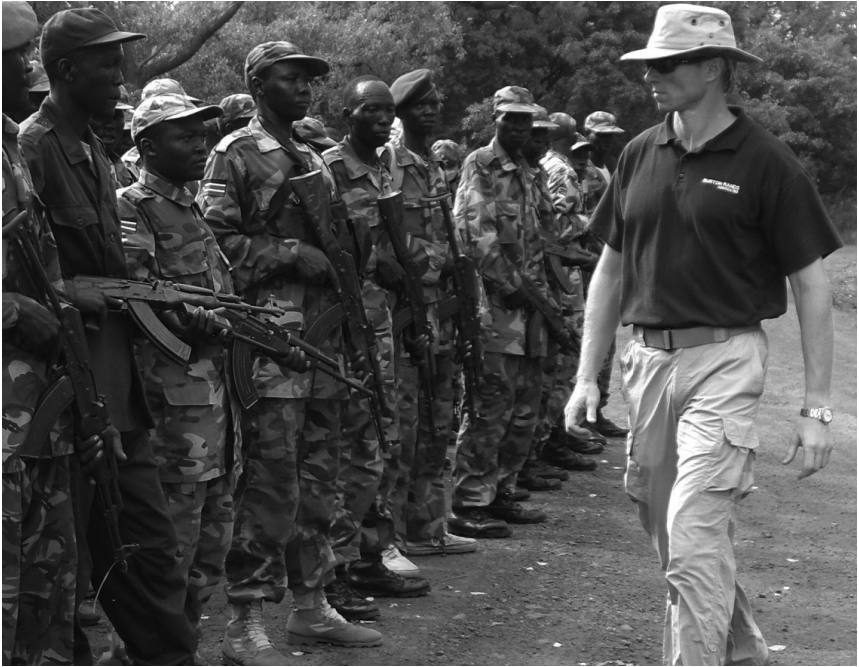
The author with SPLA non-commissioned officers during a course at Mapel Training Centre, 2009.

Although defence transformation is acknowledged as a ‘long process and not an event’, 22 the SPLA adopted conventional military formations on a large scale and over a short period of time. On paper, therefore, the army transformed from a guerrilla force to a conventional army in a matter of months. Yet with insufficient resources, underdeveloped administrative processes, a lack of understanding of conventional military theories among the majority of officers, and limited training and discipline in parts of the army, it has faced significant transformation challenges ever since.