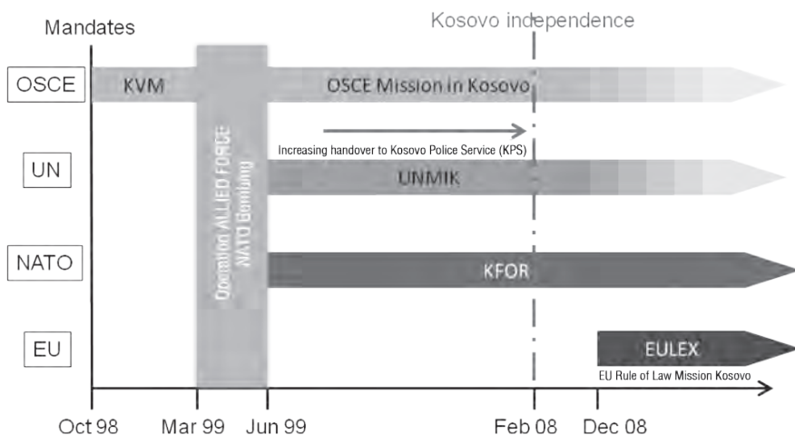
Figure 4-1. Timeline of the Various Multinational Missions in Kosovo.

The United States did not provide the leadership of KFOR (initially led by British General Sir Michael Jackson), UNMIK (the initial Special Representative for the Secretary-General [SRSG] was French Diplomat Bernard Kouchner), nor for any of the four pillars, but was and remained a major contributor to the success of the international commitment throughout this period. The United States provided leadership of and the main component of one of KFOR's five Multinational Task Forces, as well as the largest contingent of police officers (not including Formed Police Units) in the UNMIK and the leadership of the OSCE police training mission.