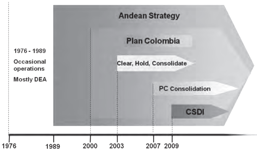
Figure 3-1. Timeline and Key USG-Colombia Strategies. 15

that have a stable security situation and an increased government presence in the form of police stations and small courts, the USAID takes the lead in providing necessary support to set up economic and community development projects alongside Colombian ministries and regional actors (see Figure 3-1).