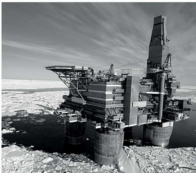
The perception of the High North as a 'treasure chest' is partly exaggerated, as estimates of the Arctic hydrocarbon reserves are unverifiable.

offshore oil and gas fields, presumably operate on the basis of more precise estimates. They are, however, in no hurry to invest in costly projects on the Arctic shelf and have even cut exploration budgets, with Yuri Trutnev, minister for natural resources and ecology, arguing for reforming the legislation and opening the off shore 'green-fields' to foreign investors (Melnikov, 2010). Gazprom and Rosneft can easily block such initiatives, but they cannot make a convincing plan for developing the licences that they have amassed. Speaking at the gas industry conference in October 2010, Putin set a goal to increase production from 650 bcm to 1,000 bcm a year, but Gazprom's track record proves that the giant company is chronically unable to build its 'upstream' base (Putin, 2010b). In the early 1990s, its average annual production was about 550 bcm, and in the mid-2000s it managed to climb to the same plateau, before plunging to 460 bcm in 2009 and making a partial recovery at 500 bcm in 2010. 3