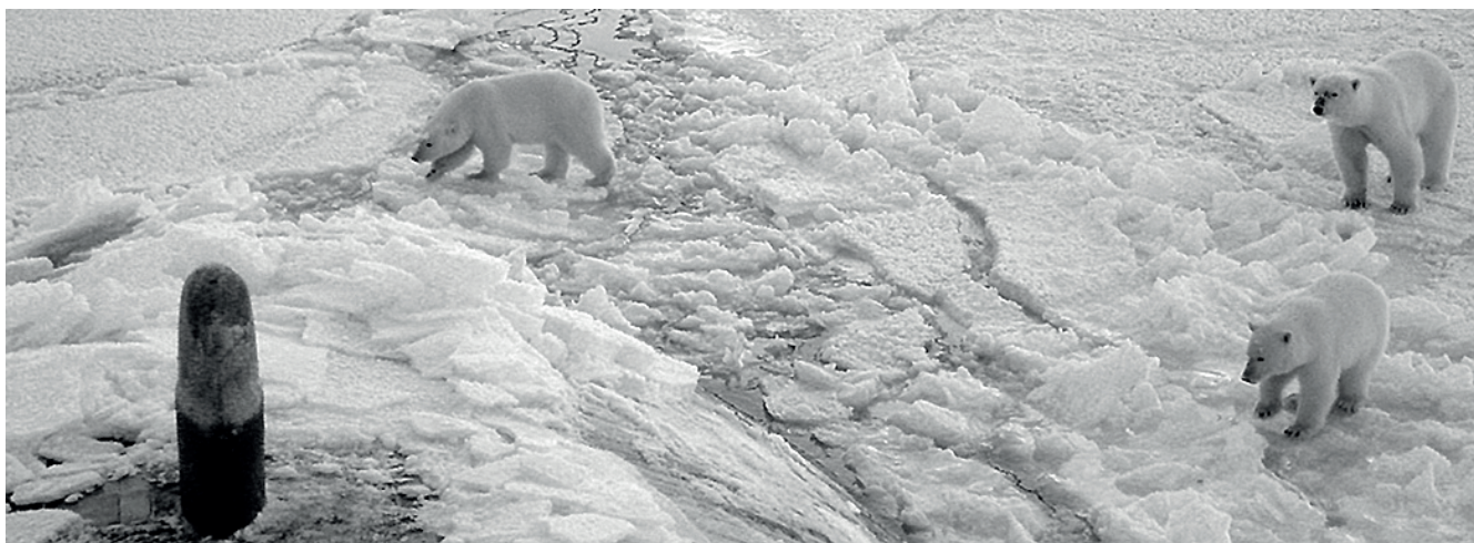
An encounter in the Arctic: polar bears meet with the attack submarine USS Honolulu that surfaced close to the North Pole.

The maritime border delimitation deal between Russia and Norway sensationally announced by President Dmitri Medvedev in Oslo on 27 April 2010 and signed in Murmansk on 15 September 2010 warrants a re-appraisal of Russia's Arctic policy. The penchant for sensationalism often spills over from the media into policy analysis, which recycles perceptions of the 'struggle for resources' reaching the intensity of a 'great Arctic game' and escalating into a 'new Cold War'. 1 In reality, however, Moscow has not overstepped the rules of international law and has remained committed to the 'club regulations' of several Arctic institutions, so 2010 might set the trend towards a de-escalation of tensions in the High North. It would have been too simplistic to explain away the pronounced emphasis on cooperation in Russia's foreign policy with references to the impact of the economic recession, which has undercut the previous rise of ambitious self-assertiveness. Rather, the Arctic policy is shaped by a dynamic interplay of poorly compatible Russian interests and intentions, and this paper seeks to demonstrate that this interplay cannot be reduced to an equation of security imperatives and economic drivers because immaterial ideas add to its complexity.