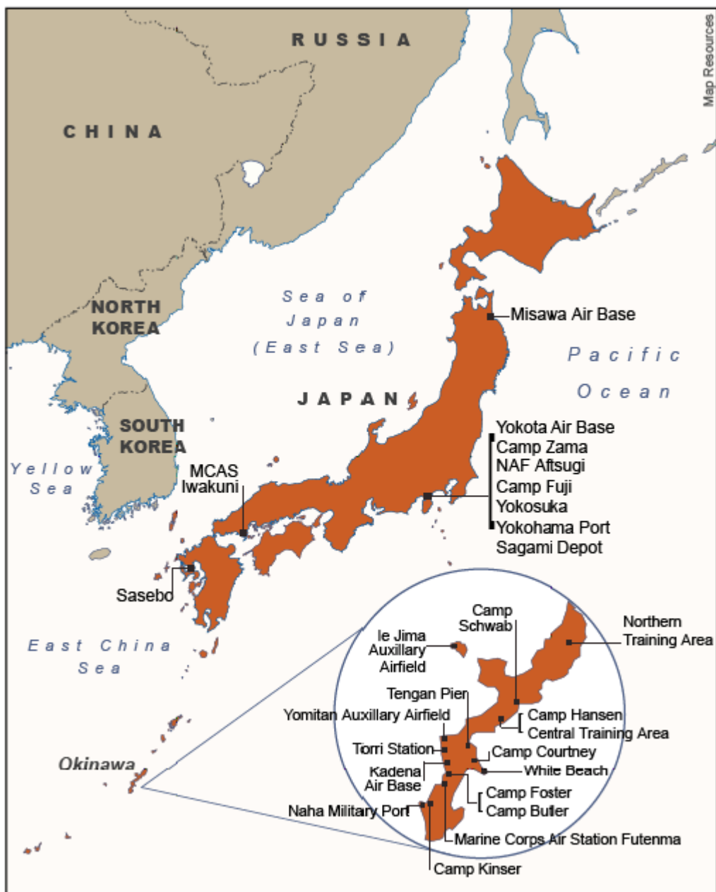
Figure 2. U.S. Bases in Japan

On mainland Japan, there are seven different bases/posts. Yokota and Misawa, representing the Air Force; Camp Zama, representing the Army; Iwakuni, the Marine Corps; and Yokosuka, Atsugi, and Sasebo, the Navy.