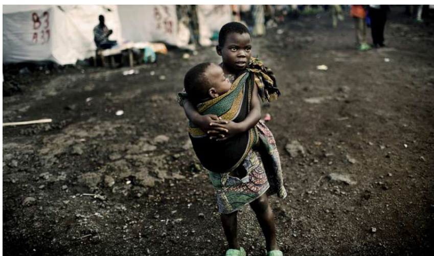
Human security concentrates on protecting the individual: Children in a refugee camp in Kibati, Democratic Republic of the Congo.

The concept of human security expanded the notion of security. The shift in focus from the state to the individual as the core object of security acknowledged the fact that intra-state conflicts such as civil wars, political violence, diseases, or poverty were greater threats to humans than inter-state wars. The concept has not brought about a paradigm shift in international security policy. But human security will most likely remain politically relevant even after recent changes in the strategic framework.