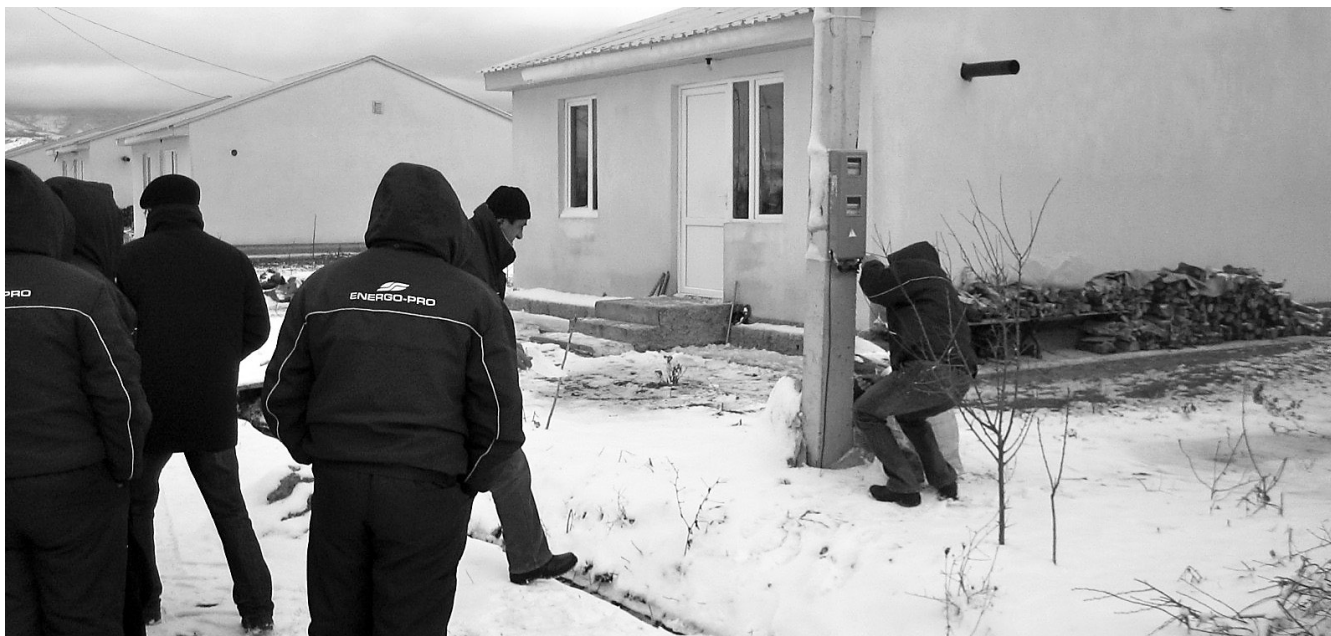
Electricity company cutting off houses from delivery due to non-payment of bills in Didi Khurvaleti IDP settlement.