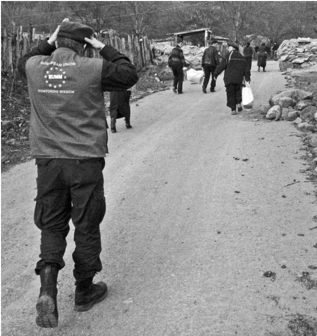
EU monitor following the delivery of humanitarian aid in Perevi 2010.

Group analysis conducted in 2008, the conflict with Georgia has chimed well with Russia's overall policy to stand against the "Westernization" of the former Soviet countries, and the intervention in the conflict in the South Caucasus serves as an example to others, especially Ukraine, not to go down the same path.