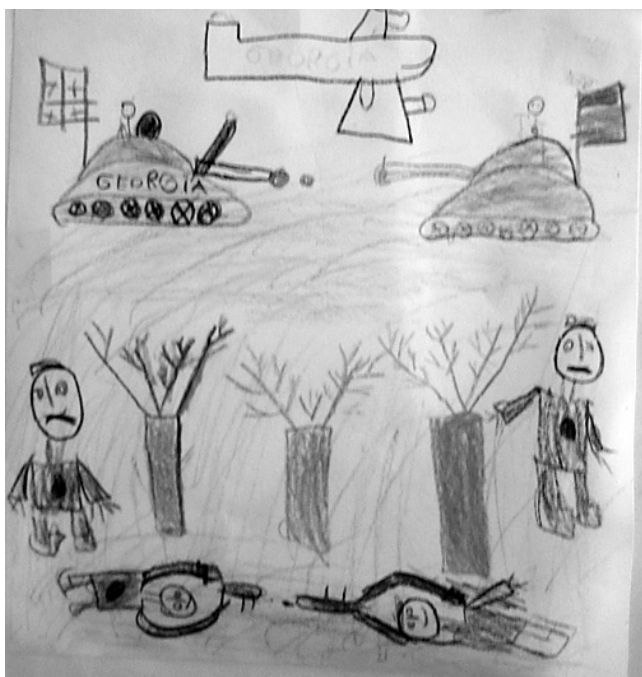
A drawing from a psycho-social recovery project directed for primary school children living in the conflict zone, Mereti 2009.

According to the EUMM's self-assessment, it has succeeded in stabilization, but significant work remains to be done with regard to confidence-building, which is one of the main tasks of the operation. The reason for not being able to contribute more to the confidence-building effort is that Russia has not complied with the peace agreement and withdrawn from the breakaway districts, allowing the EUMM to step in—a situation which the EUMM cannot tackle without a strong and coherent EU policy towards Russia. However, there are other aspects that have placed the EUMM in a situation where its raison d'être is at stake. People on the boundary lines have criticized the EUMM because it can do little more than record incidents after they have occurred. Although the EUMM is a civilian mission, its mandate is limited to monitoring mostly military issues. As a result, the human security-related dilemma that has emerged on the boundary line has not received sufficient attention.