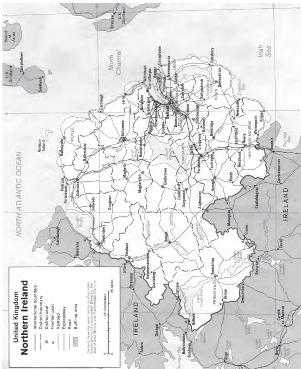
Map 1. Northern Ireland.