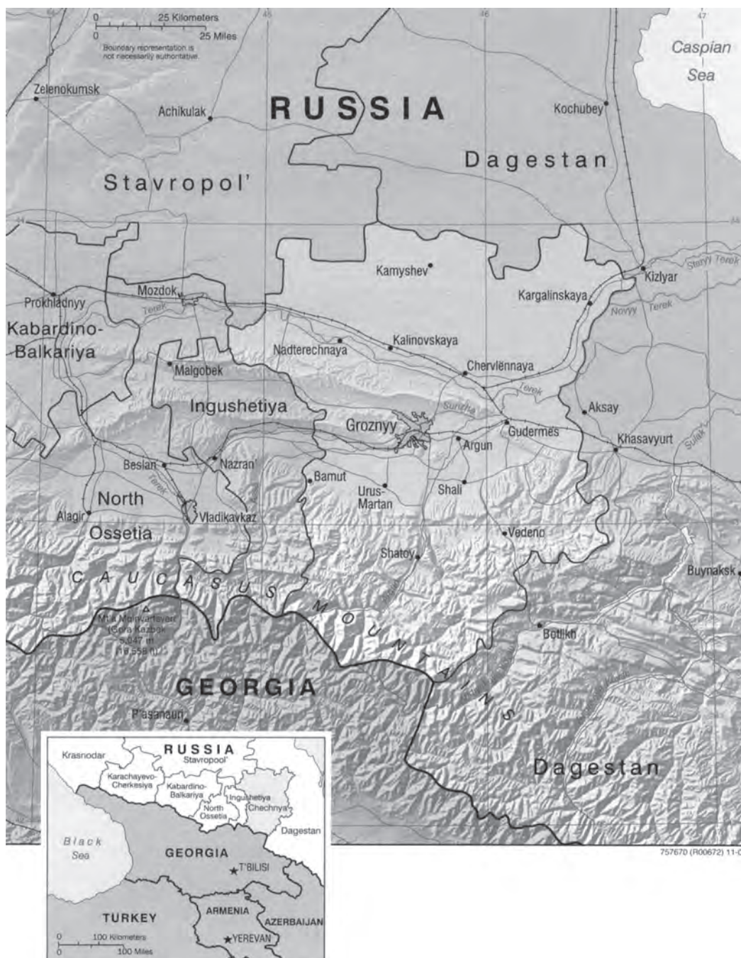
Map 2. Chechnya and Neighboring Russian Republics.