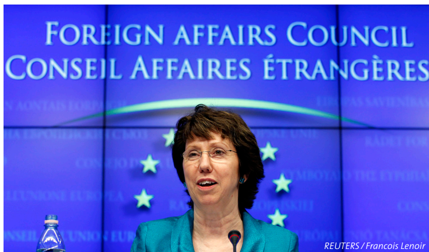
High Representative Catherine Ashton briefs the press on the Foreign Affairs Council, Brussels, 23 May 2011

Since the entry into force of the Lisbon Treaty 18 months ago, the EU High Representative for Foreign Affairs and Security Policy has not managed to establish viable partnerships with her national counterparts. Still, attempts have been undertaken to adapt the European Neighbourhood Policy and strategic partnerships to the new set-up. While the revised neighbourhood policy lacks ambition in the realm of CFSP, the strategic partnership concept is thin on substance. Close coordination and complementary action by the member states are required for both policies to succeed.