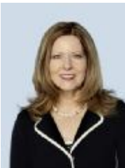
Erika Mann Executive Vice President Computer & Communications Industry Association Member of the Board of Directors Internet Corporation for Assigned Names and Numbers (ICANN)