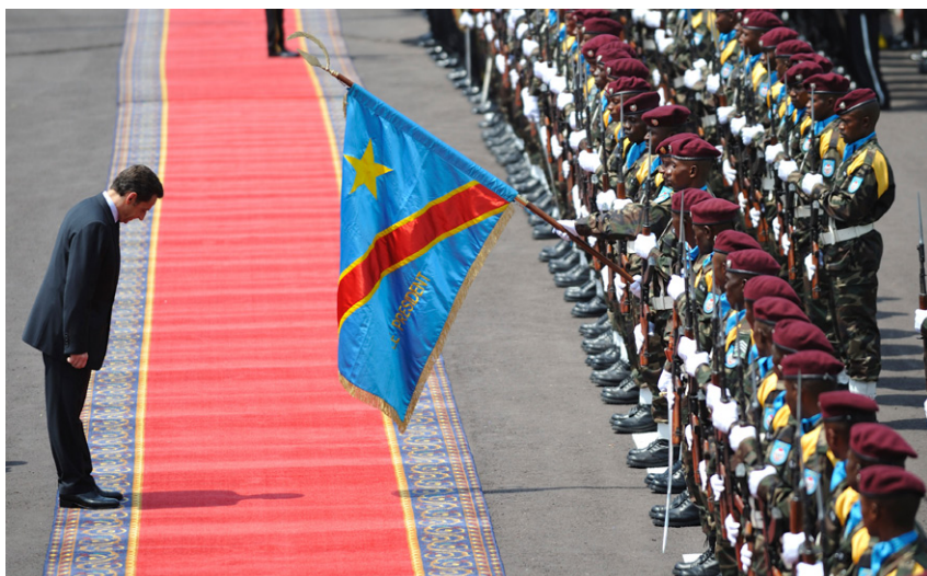
France's President Sarkozy reviews an honour guard in Kinshasa, 26 March 2009

The Democratic Republic of Congo (DRC) is home to risky contradictions: despite being very “rich” in natural resources, it remains consistently “poor” in solid and legitimate state structures. Europe conducts numerous efforts to strengthen Congolese social and economic infrastructures, offering security and governance support alongside more traditional development projects. But its actions suffer from situational ignorance, fragmentation, and policy frailty. A coherent and strategic (international) approach is urgently needed to provide valuable impetus to the most pressing Congolese needs.