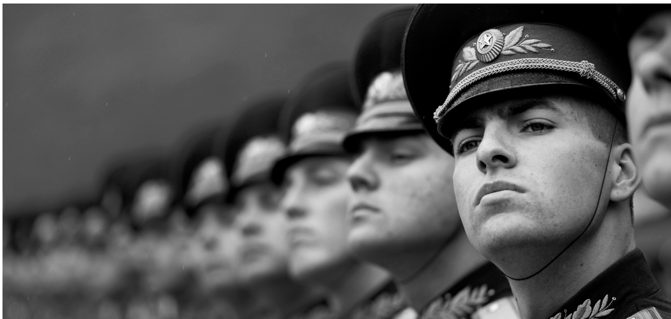
Russian Honour Guard standing in attention at the Tomb of the Unknown Soldier in Moscow.

The Russian authorities are currently undertaking reforms of the two main “power structures” – the Ministry of Defence and the Ministry of the Interior. Such reforms are always precarious, especially in Russia and particularly at a time when the political establishment is preparing for the election period. The Russian authorities have traditionally been very cautious in their attitude towards the so-called “power structures” ( silovye struktury ) 1 during the pre-election period. There are several reasons for this.