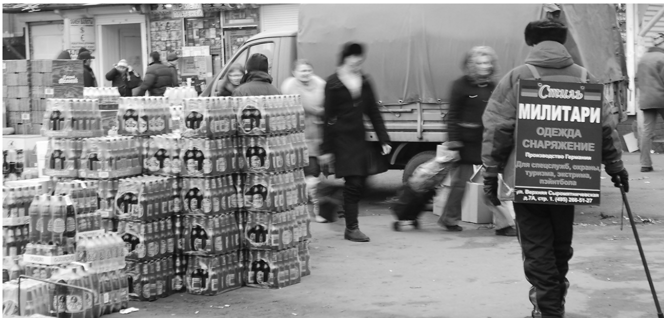
Advertisement of military-style clothing at the Kursk railway station in Moscow.

Even in the ultra-centralized Soviet state no official wielded that degree of power. True, certain administrative departments of the Communist Party's Central Committee carried a great deal of weight in supervising the power structures. But their superiors were the Politburo members who, in turn, answered to the Central Committee members. What is significant is that the Security Council Secretary is a member of the consultative body consisting of the defence minister, foreign minister and director of the Federal Security Service – all of whose functions the Secretary now controls. In effect, he is the first among equals.