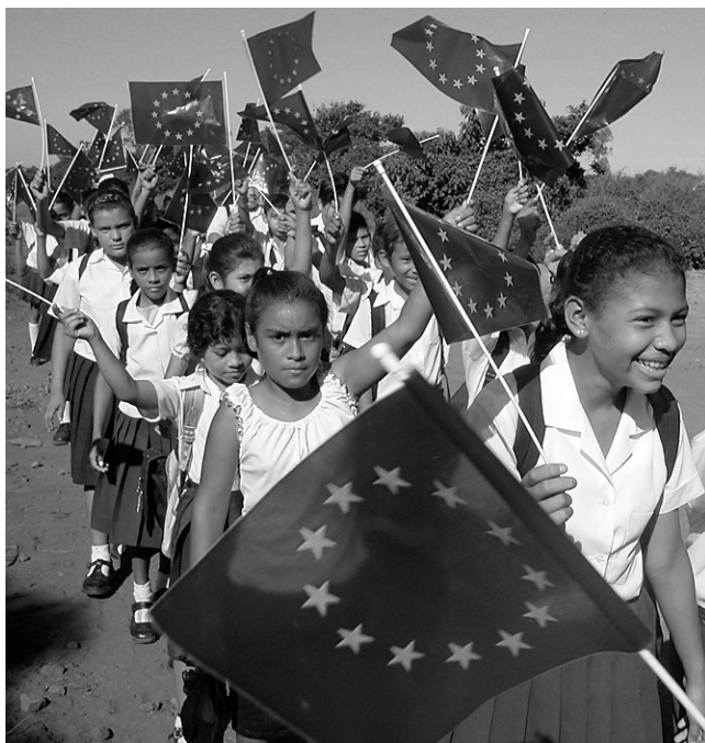
Nicaraguan primary school pupils waving EU flags. Nicaragua is a major recipient of EU development funding in Latin America.

to encompass the immediate external policies, while improving the traditional ‘development aid politics’ along the lines of international commitments. This statement showed that the EU development policy was no longer merely about the politics of aid. It was also a call for the neighbouring branches to respond. With the changes brought about by the Lisbon Treaty, the task of clarifying the interrelations between the three external branches is now more pressing than ever.