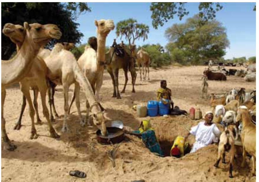
Nomads pause to give their camels water in the Nyala region.

The use of technology to address environmental conflict and improve human security is illustrated by the work of Practical Action and SOS Sahel. Practical Action intervenes in resource-based conflicts using an NRM focus – for example, through the improvement of grazing, opening up and/or agreeing on livestock routes, the provision of seeds, the establishment of water points, and training paravets. Practical Action also promotes 'peacebuilding technologies', including early maturing crop varieties and improved millet/ sorghum varieties that make planning for harvesting easier, given that many conflicts arise because harvests are delayed and crops are destroyed by the arrival of migrating livestock (Majzoub Fidiel, 2010). In another innovative pilot project, SOS Sahel built a sand dam in Southern Kordofan. The sand dam technology which belongs to SOS Sahel was first