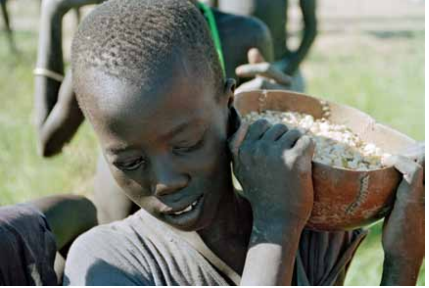
A young boy gathers grain spilled from the air-drop programme of the World Food Programme near Thiekthou., Bahr El Ghazal, Sudan.