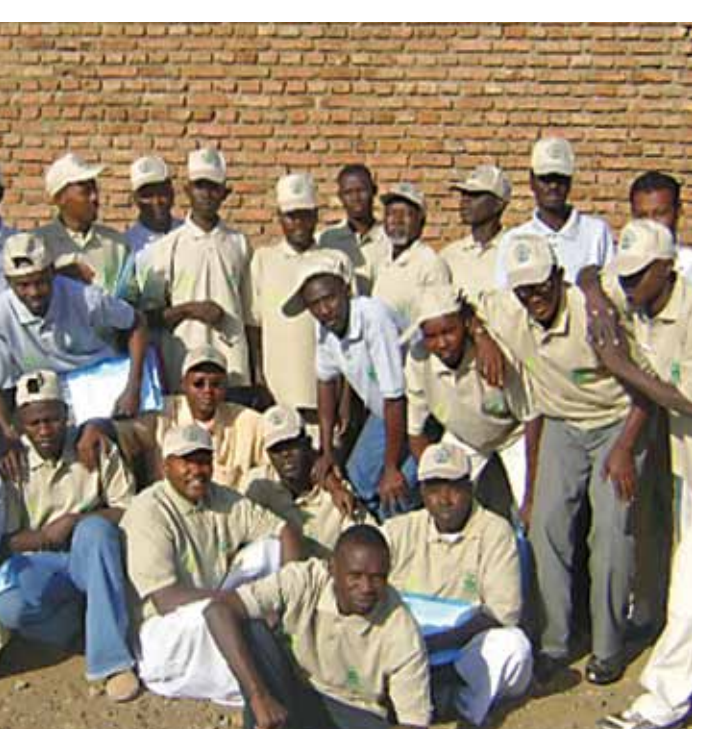
Graduates from a conflict resolution training course, offered by the Sudan Environmental Conservation Society.

and traditional leaders of other tribes attended, with a clear statement from local government that it was committed to implement the decisions taken during the workshop. After deliberations, resolutions and recommendations were signed by the tribal leaders and witnessed by local government officials and by other tribal leaders of the area (Adlan Services and Development Organization, 2009). The outcomes of the meeting and agreement focused on a range of issues that are not directly related to land or the environment, but which aim to improve development, on one hand, and human security, on the other. Other dialogue platforms held by Adlan and the other organisations interviewed followed a similar process.