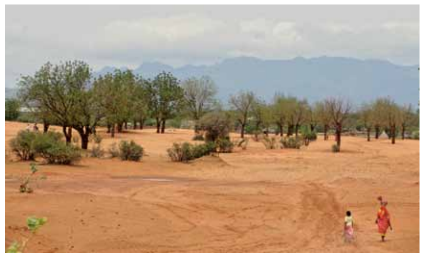
A woman and child walking in a remote part of Northern Kordofan, with the Nuba Mountains in Southern Kordofan in the background.

Migratory routes are very much part of the pastoralist identity and their way of life – "not simply transit routes from A to B, the [live]stock routes must accommodate pastoralists' complete social life, such as trade, ceremonies and family commitments"