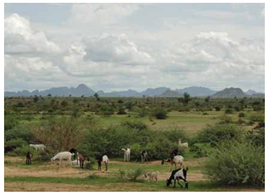
Southern Kordofan, with the Nuba Mountains on the horizon, during the rainy season.