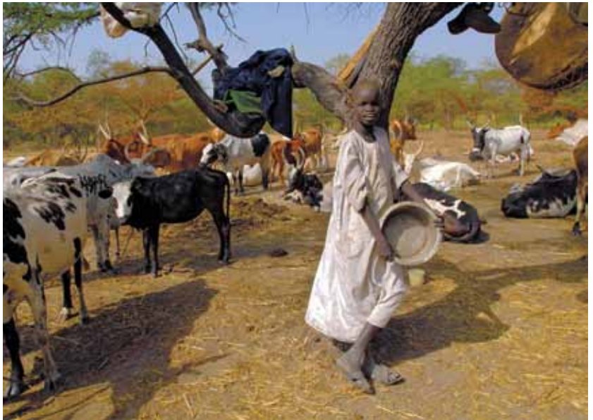
A young girl of the nomadic Ngok Dinka tribe of the Sudan leads cattle to water and food in Abyei, Sudan.