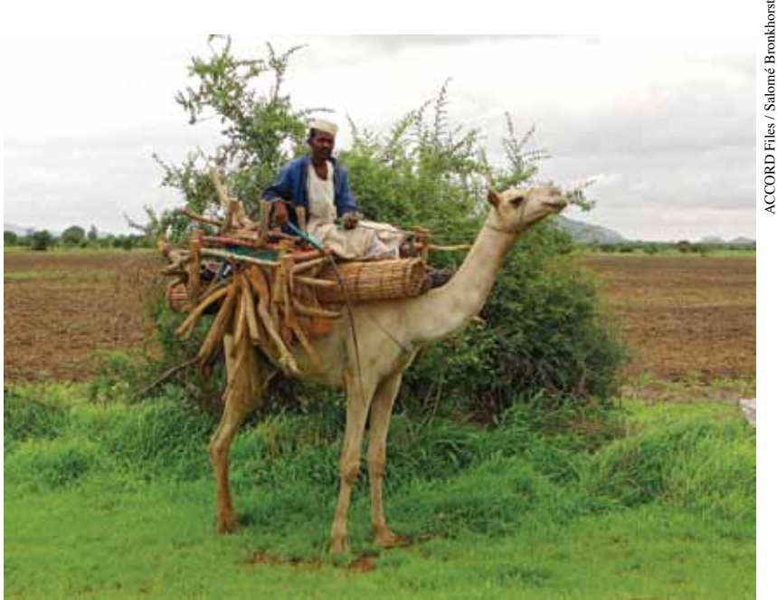
Southern Kordofan: a pastoralist on his way north, rests near a cultivated field.