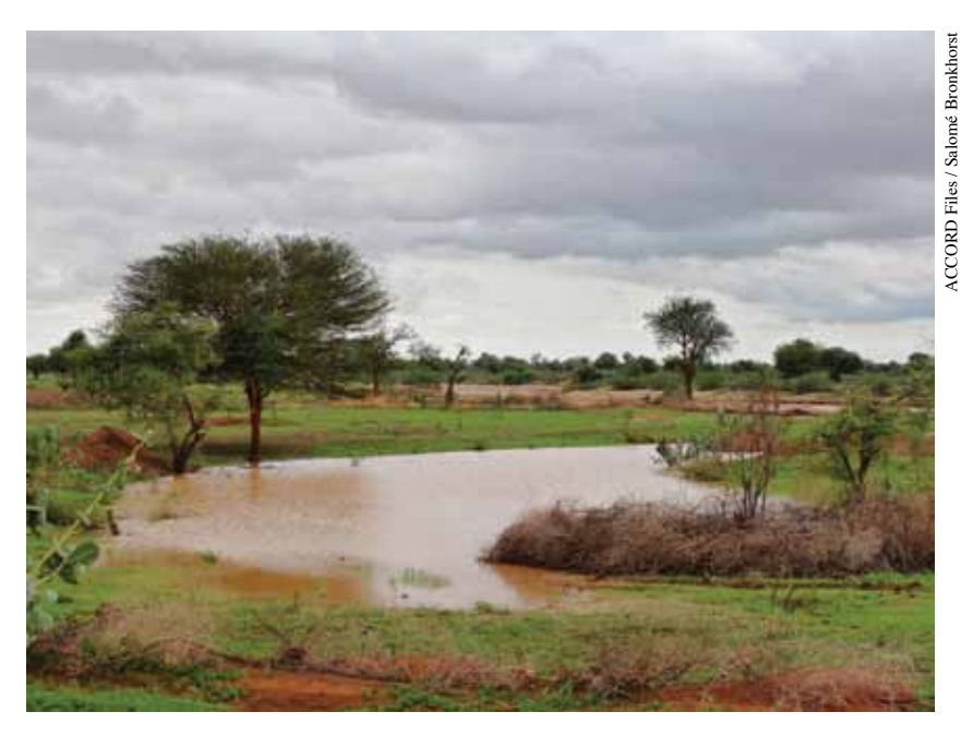
A man-made dam or hafir, which captures run off and provides critical resources for pastoralists along livestock routes.

project area, to ensure the coordination and sustainability of projects and to prevent overlap (SECS, 2010a; Badawi, 2010).