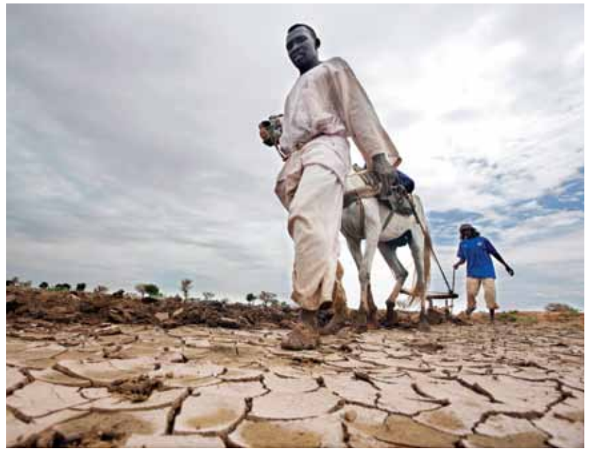
Non-mechanised farming on arid land in Sudan.

Finally, scaled approaches that address environment-related conflicts at local, national and sometimes even federal level should include critical developmental interventions that focus on deprivations and exclusions. The dilemma is where to focus and where to spend the development funding – for this, as discussed, early warning systems that take into account localised environmental threats, deprivations and exclusions and vulnerabilities will be critical.