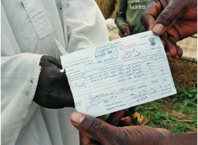
Tax receipts for the sale of wood: farmers report that high taxes are levied on the sale of wood; despite this measure to curb deforestation many poor farmers continue to sell wood, which they say produces enough income for food only. The sale of wood and charcoal is contributing to deforestation which degrades grazing areas and causes desertification.

and a lack of management of animal and human populations, which in turn has led to intertribal issues (Saeed et al., 2009a; Saeed, 2010).