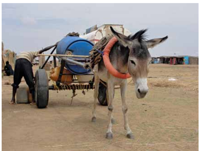
Kadugli, Southern Kordofan: even during the rainy season drinking water and fodder are not available freely, and are transported by donkeys to their destinations.

SECS's Water for Peace Project also works to reduce vulnerability by re-establishing traditional social structures for conflict resolution, which were eroded through conflict and displacement. Another objective is to reduce inequalities and exclusions in the access to and control of water resources for the 27 500 people and 18 000 head of livestock in the project area that depend on the water supply. By improving basic sanitation, the project not only safeguards the quality of water resources but also improves the health and well-being of farmers and pastoralists, and especially that of women and girls. Finally, SECS creates platforms for dialogue and capacity building – through workshops, training sessions and sensitisation missions – for conflict resolution, with a focus on water management and sharing, hygiene and peacebuilding. It also collaborates with other private and government stakeholders in the Water for Peace