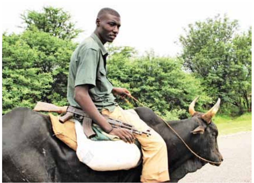
A young armed pastoralist in Southern Kordofan, on his way north with his family and their livestock.

and exclusions refer to development indicators that contribute to conflicts - specifically poverty, social exclusion, marginalisation and a lack of livelihood alternatives. Vulnerability is a person's or group's "exposure, sensitivity and resilience" to an environmental threat, in the context of deprivations and exclusions (Busumtwi-Sam, 2008:21). In other words, human (in)security is a state, determined by threats that can cause harm, but those threats can only harm if the unique context in which a person finds oneself does not provide one with the means/ability to cope with or mitigate the threat. Whether that person is in a state of security or insecurity, therefore, depends on a minimum threshold of "dignity, safety/ survival, health and well-being and livelihood" (Busumtwi-Sam, 2008:16). This report argues that thresholds will be determined effectively by the institutions (governments, international organisations and NGOs, for instance) addressing the issue of human (in) security at that point in time. The underlying logic of this is that the same threat in different contexts may lead people to experience different states of either security or insecurity. Equally, and perhaps controversially, whether someone is facing insecurity or not is thus also dependent on the values and thresholds set by particular actors at a specific point in time.