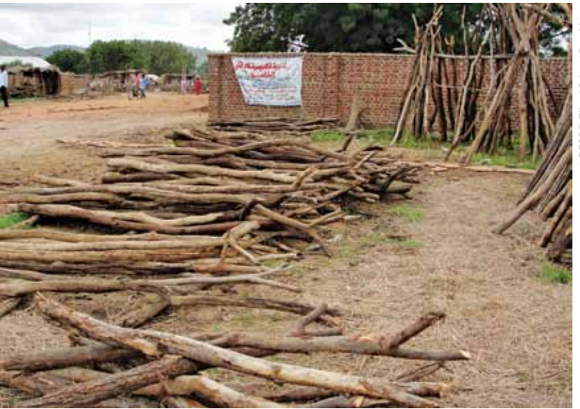
Kadugli, Southern Kordofan: the sale of wood and charcoal is contributing to deforestation which degrades grazing areas and causes desertification.

workshops were held and paravets were trained to reduce vulnerability of and stress on pastoralist communities, who often cannot afford or reach vets.