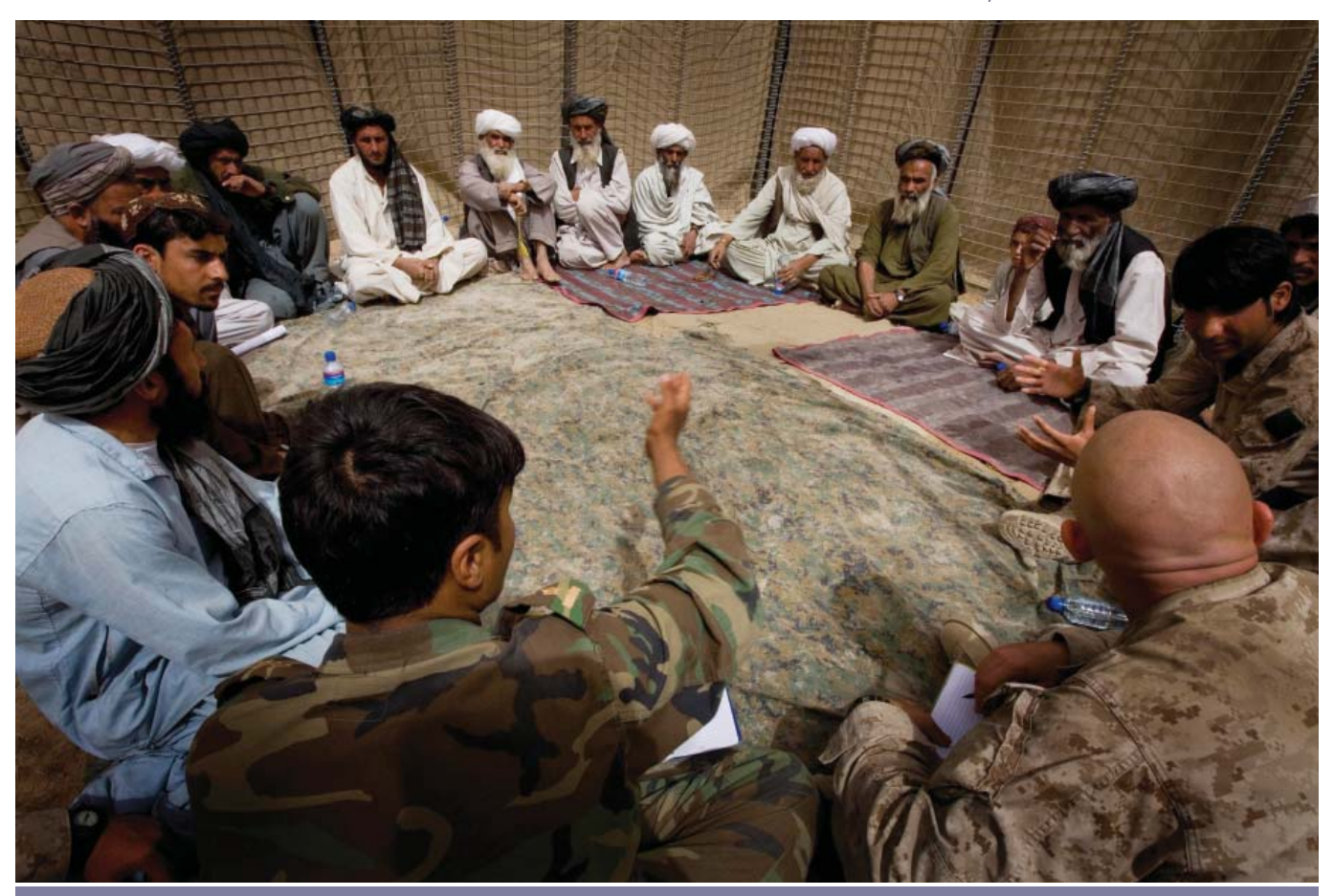
A Soldier discusses plans for a new school and health center with community leaders at a meeting Mian Poshteh, Helmand Province, Afghanistan.