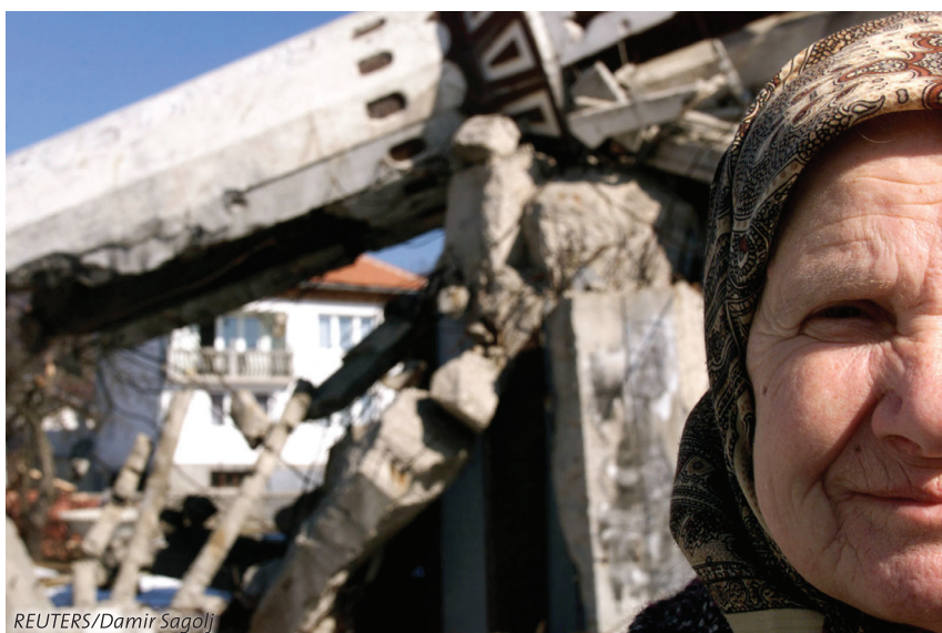
Religious symbols under fire: A Muslim woman in front of a destroyed mosque in Bosnia.

Conflicts involving religious dimensions often seem more difficult to resolve due to the indivisible and non-compromising nature of religious identities and issues. Nevertheless, mediation has the potential to facilitate negotiations between conflict parties, which can lead to peaceful co-existence. The key is to look for practical solutions that address the involved parties' concerns and that are compatible with their worldviews and values. To do this, mediators need to avoid judging parties' religious worldviews and understand that religions shape behaviour, but they do not dictate it.