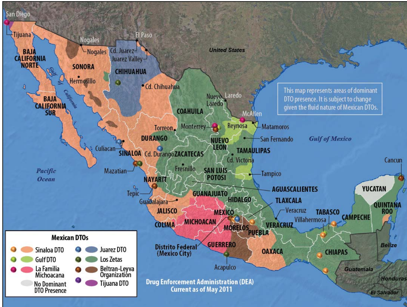
Figure I. Map of DTO Areas of Dominant Influence in Mexico