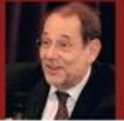
Javier Solana , former EU High Representative for CFSP