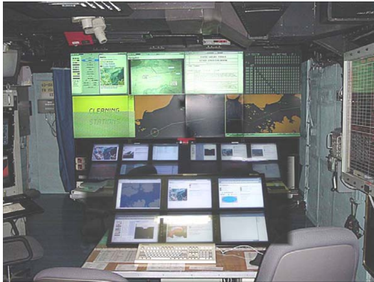
Figure 3. Knowledge Wall 8

exercise revealed some challenges regarding use of KWall, including poor assessment capability of information validity, saturation of information upload, and individual's inability to effectively use more complex KWall tools, RADM Zelibor became aware of the type of communication and collaboration that could occur if an information-sharing platform was established for all personnel. Whereas RADM Zelibor knew that flag officers typically have sufficient C2 tools to enable strategic- and operational-level goals, he also felt that the KWall could have significant impact for the tactical warfighter as well.