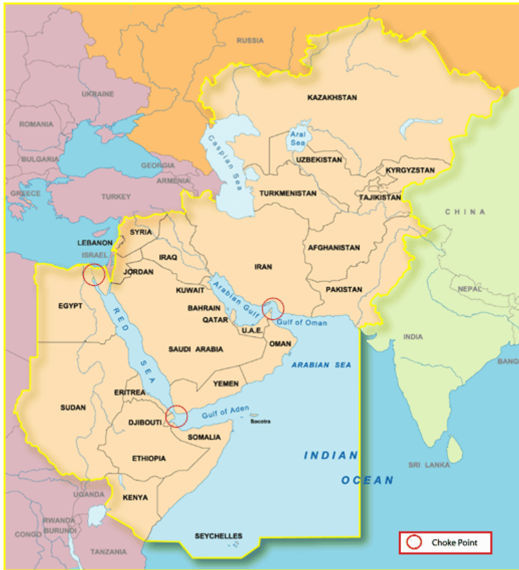
Figure 1. United States Naval 5 th Fleet Home Location and AOR 4

The task force included a Carrier Strike Group (CSG)—formerly called a carrier battle group (CVBG), combat aircraft, and other support elements including units and ships. The CVBG typically consisted of an aircraft carrier, a Destroyer Squadron (DESRON) and a carrier air wing. Carrier Group Three (CARGRU3) was dual-hatted, operating under the command of the Fifth Fleet as Commander, Task Force 50 (CTF-50). CARGRU3 consisted of the nuclear aircraft carrier USS Carl Vinson, Destroyer Squadron Nine (DESRON 9), and Carrier Air Wing 11 (CVW-11), along with their component ships and aircraft squadrons.