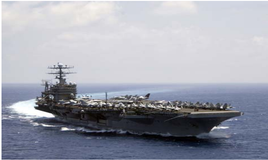
Figure 2. Image of CVN-70, the USS Carl Vinson 5

However on 11 September 2001, terrorist attacks on American soil altered the commander's operational courses of action (COA). Vice Admiral (VADM) Charles Moore, Commander, U.S. Naval Forces CENTCOM, and Commander, Fifth Fleet, ordered the formation of a multicarrier battle force under the command of RADM Zelibor. CARGRU3 became the core command of what would be designated TF-50. Figure 2 is a picture of CVN-70, the USS Carl Vinson. When VADM Moore passed the order, the battle group changed course and by 12 September had arrived in the North Arabian Sea to spend the next 3 months supporting OEF. By 7 October 2001, the battle group had launched the first strikes in support of OEF.