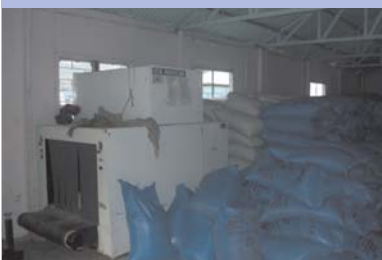
Scanning Machine for Goods

Around 170 traders have applied for permission to trade in the Poonch sector.