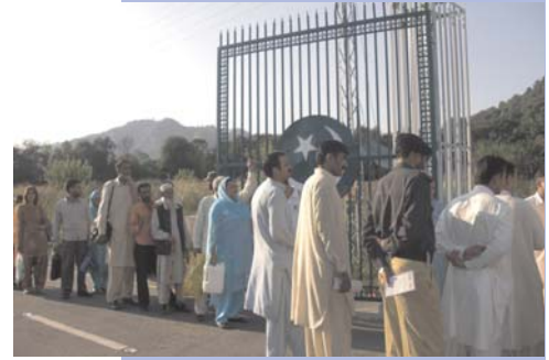
Waiting to Cross the LoC, Poonch

and truck services. On July 18, 2008, the India-Pakistan Joint Working Group on cross-LoC CBMs met in Islamabad to simplify the procedure for issuing cross-LoC travel permits; to increase the frequency of the Srinagar-Muzaffarabad bus service; to launch a postal service between the two cities; and to expedite the cases of inadvertent crossings of the LoC; and discussed the list of items to be allowed for trade through the truck service. A triple-entry permit for cross-LoC travel was approved. This facility was to be made particularly lenient for the senior citizens. The announcement in this regard was made on July 21, 2008, when the Foreign Secretaries of the two countries met in New Delhi. India's Foreign Secretary Shiv Shankar Menon said, "The Chambers of Commerce are to meet very soon to discuss cross-LoC trade and to finalize arrangements" 5 .