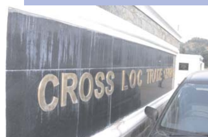
Trade Facilitation Centre, Chakan da Bagh

Trade in this sector mainly involves 57 traders from Poonch, some from the Valley, and some from Delhi and Amritsar, who operate through their agents. Unlike the Traders' Union in the Valley, there is no such union in the Poonch-Rawalakote sector. The traders are not permitted to travel to either side to survey the