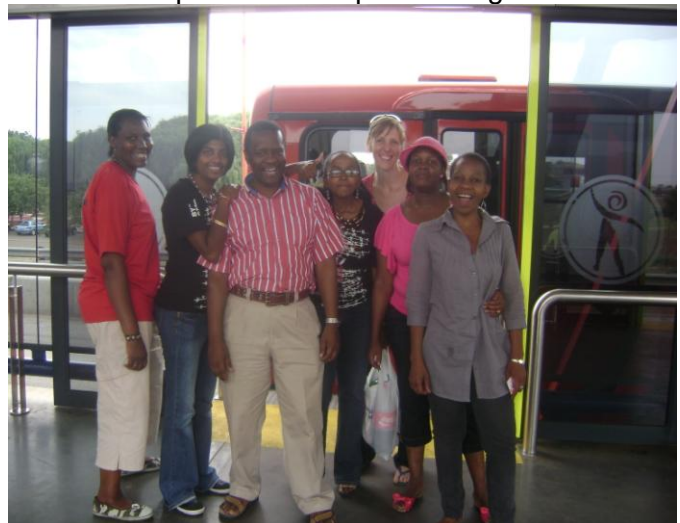
Photo: Part of the TTP team