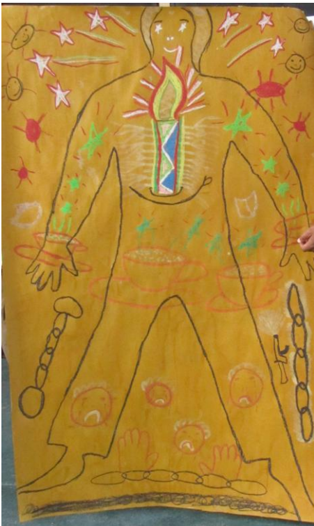
Photo: Body map produced by one of the participants

In September twelve people from the SANToC member organisations and two other organizations participated in a week-long training on creative arts approaches run by the Curriculum Development Project Trust (CDP) in Johannesburg. This approach is different to art therapy methods in that the interpretation of the art work is owned completely by the creator of the work, without the facilitator or therapist's input.