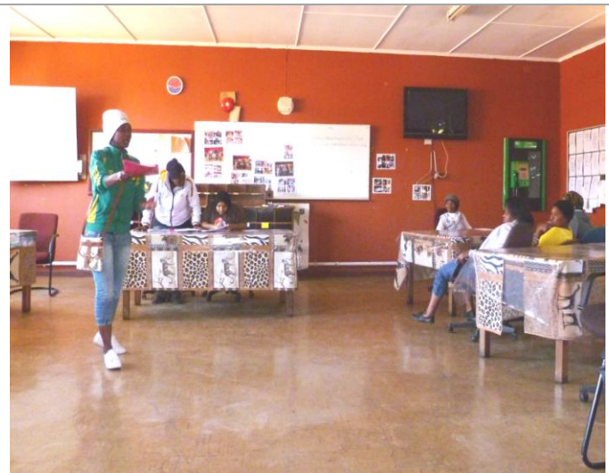
Photo: Womens group role play

The highlight of the process was the development