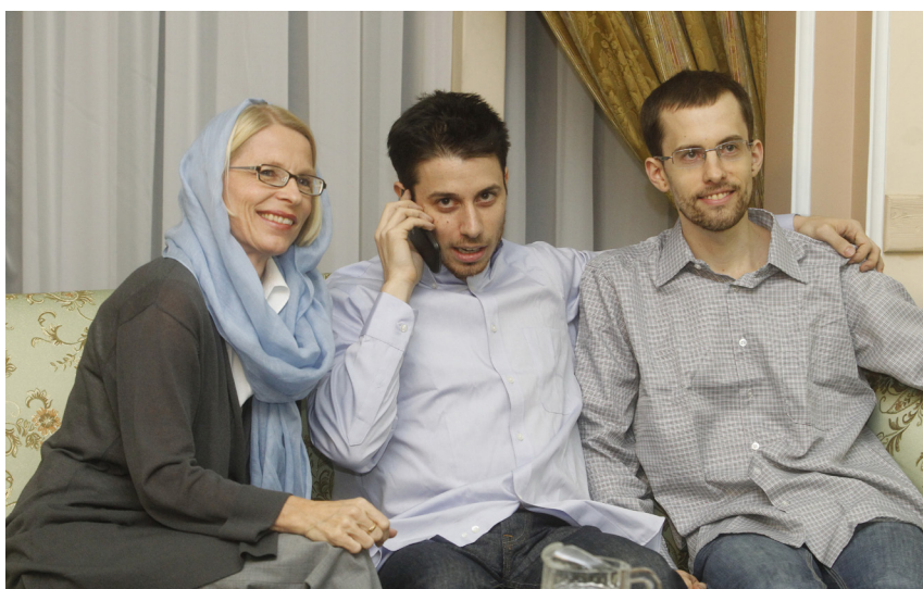
Swiss Ambassador to Tehran Livia Leu Agosti successfully lobbied for the release of US citizens Shane Bauer and Josh Fattal, who were being held in Iran. Tehran, 21 September 2011.

The importance of Switzerland's work as a protecting power, once a central element in its repertoire of good offices, has diminished. This general loss of significance contrasts with the great diplomatic relevance of individual mandates. One current example is the reciprocal representation of Russia's and Georgia's interests. A general trend reversal is not imminent, though. Switzerland should make use of advantageous opportunities without overestimating the strategic importance of protecting power activities for its foreign policy.