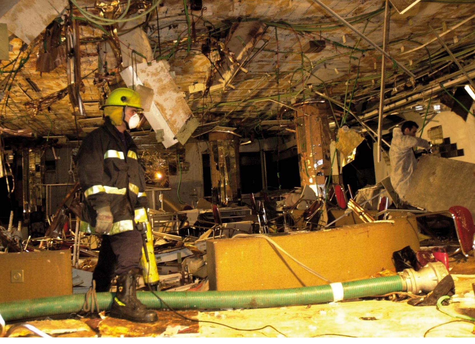
A hotel dining room in Netanya, Israel, where a Palestinian suicide bomber blew himself up among guests gathered for a Passover Seder on March 27, 2002, killing 30 Israelis and injuring 140.

But regional threats, most notably in the form of Iran and Islamic fundamentalism, still remain an area for cooperation between Israel and the moderate Arab states that is not directly related to progress in the Israeli-Palestinian conflict. This cooperation need not be in the public eye.