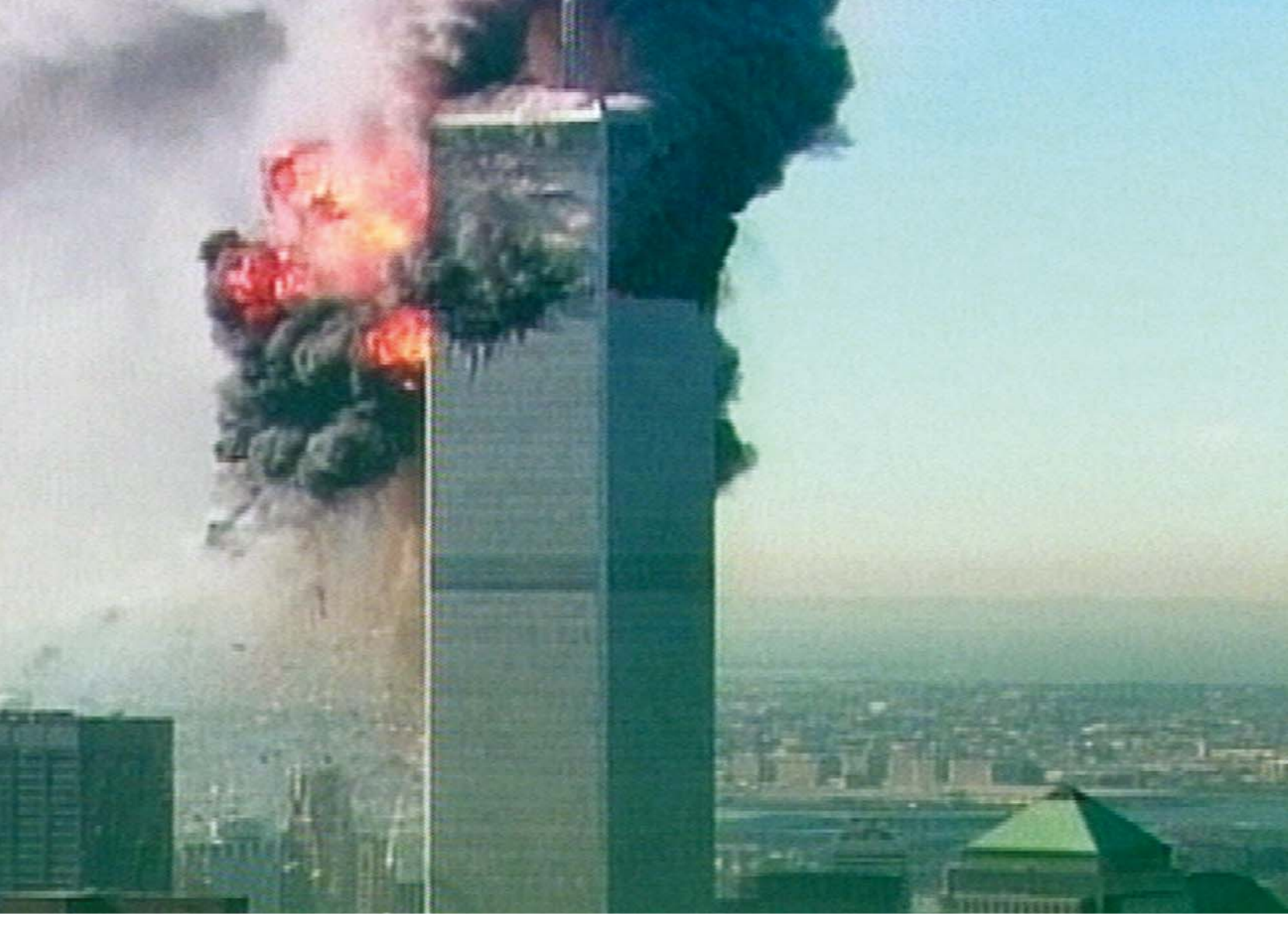
The World Trade Center in New York on Sept. 11, 2001.

within secure and recognized borders as called for by the Security Council resolutions."<sup>3</sup> After a meeting with Bush in Washington in early February 2002, Israeli Prime Minister Ariel Sharon told reporters that "at the end of the peace process, I believe that a Palestinian state, of course, will be – we'll see a Palestinian state."<sup>4</sup> By June, U.S. policy had coalesced into a "vision" for Israeli-Palestinian peace, based on two states and a new Palestinian leadership.<sup>5</sup>