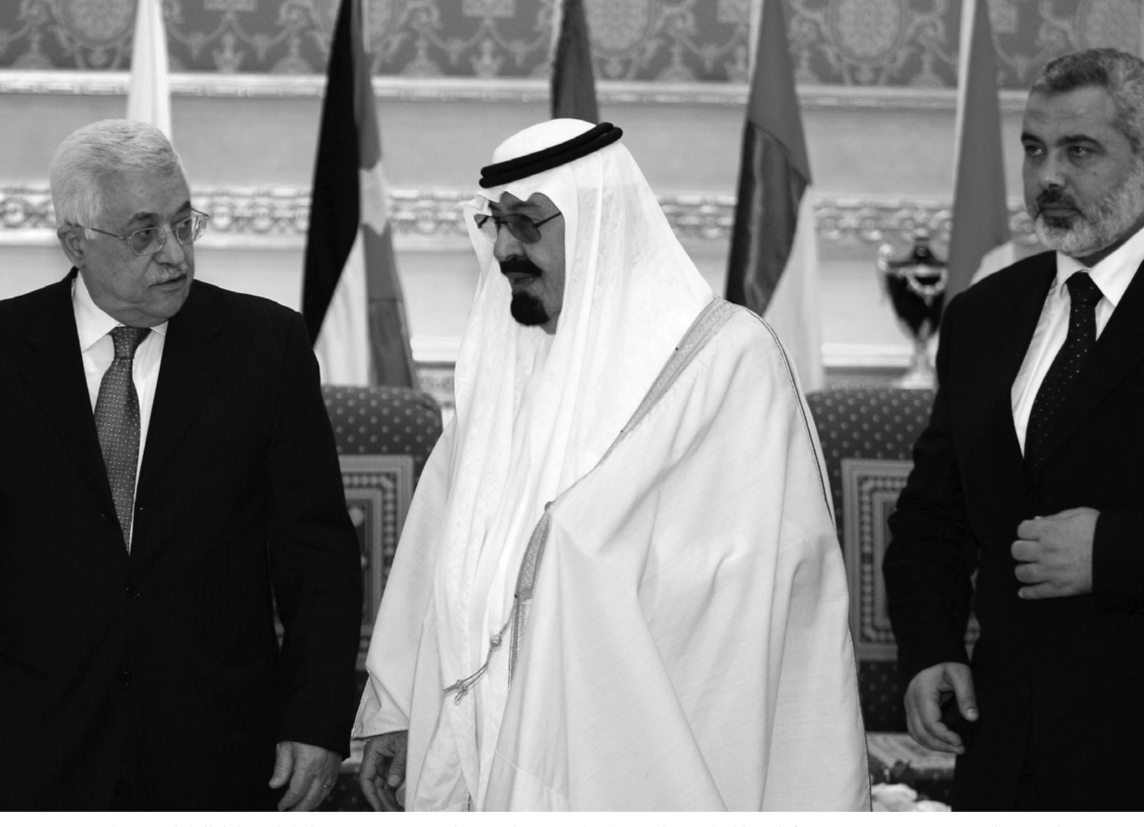
Saudi King Abdullah bin Abd al-Aziz, center, speaks to Palestinian leader Mahmoud Abbas, left, as Prime Minister Ismail Haniyeh of Hamas, right, looks on in Riyadh on March 27, 2007, prior to an Arab League Summit meeting.

of the State of Israel.<sup>55</sup> For Israel, the two-state strategy had become a way of satisfying Palestinian national aspirations without turning Israel into a Palestinian state as well, via the return of refugees.