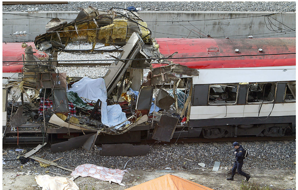
A policeman walks alongside a train that was bombed in Madrid on March 11, 2004.

ON MARCH 11, 2004, a series of coordinated bombings ripped through Madrid's commuter train system, killing 191 people. Although the attacks have been described as the product of an independent cell of self-radicalized individuals only inspired by al-Qa`ida, the extensive criminal proceedings on the Madrid bombings refute this hypothesis. 1 The network responsible for the Madrid attacks evolved from the remnants of an al-Qa`ida cell formed in Spain a decade earlier. It was initiated following instructions from an operative of the Libyan Islamic Fighting Group