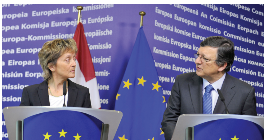
Federal President Eveline Widmer-Schlumpf meets EU Commission President Manuel Barroso in Brussels, 20 March 2012.

The changes in Switzerland's European neighbourhood brought about by the debt crisis have major repercussions on Swiss foreign and security policy. Bilateral relations with several countries have been strained because of disputes over Swiss bank secrecy. As far as the controversy with the EU over institutional issues is concerned, the scope for a compromise solution has narrowed. Conversely, there are growing security-policy overlaps between Switzerland and its European neighbours.