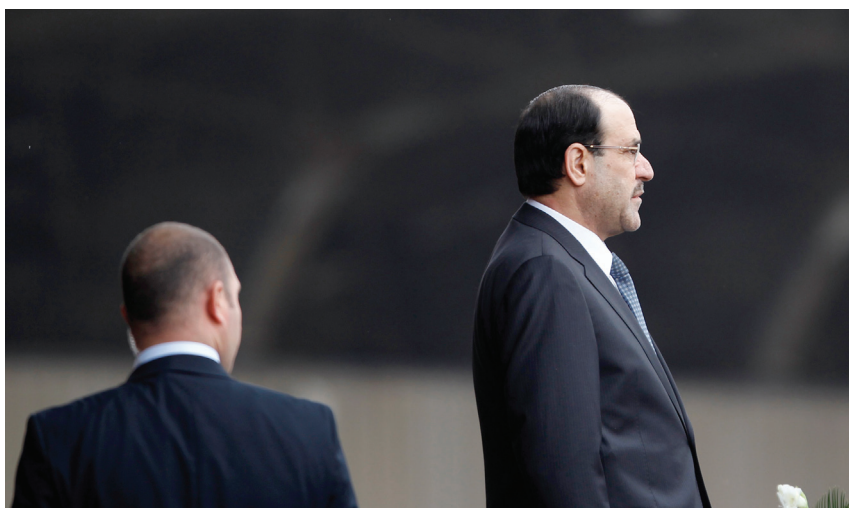
Prime Minister Nouri al-Maliki at a ceremony in Baghdad, 6 January 2012.

When the US pulled out of Iraq at the end of 2011, it could hardly hide the fact that its intervention had failed and that it was leaving behind an unstable country. The recent deepening of sectarian and ethnic cleavages, however, must also be seen as a failure of Iraqi politics. A new explosion of violence is no longer off the cards, especially since the regional power struggle between Iran on the one hand and the Sunni Gulf monarchies and Turkey on the other is exacerbating centrifugal forces in Iraq. The crises in Syria and Iraq are increasingly overlapping.