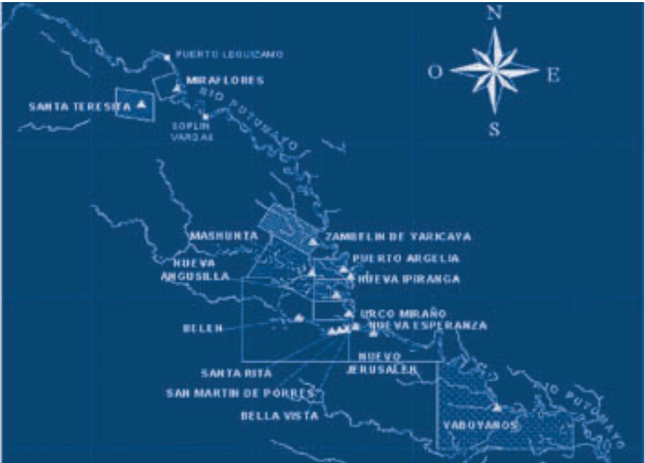
Map 1. The titled native communities in the Teniente Manuel Clavero District

Source: Detail adapted from the map "Territorio de las Comunidades Nativas Tituladas del Río Putumayo", Information System on Native Communities of the Peruvian Amazon (SICNA), Instituto del Bien Común (April 1998). The map was adapted to the actual ubicación of the communities of Bellavista, San Martín de Porres and Santa Rita.